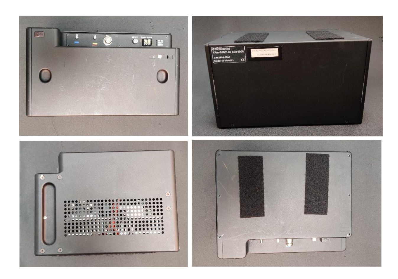
Overall View Size: W X D X H = 300mm X 235mm X 168mm