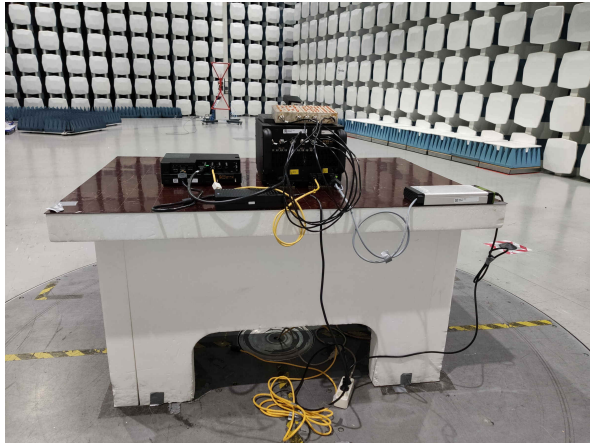
B100 Model J