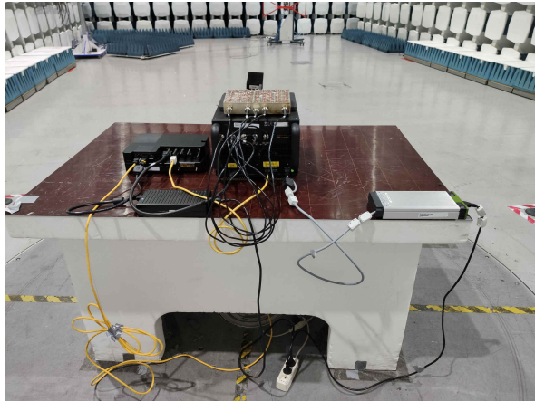
B100 Model I