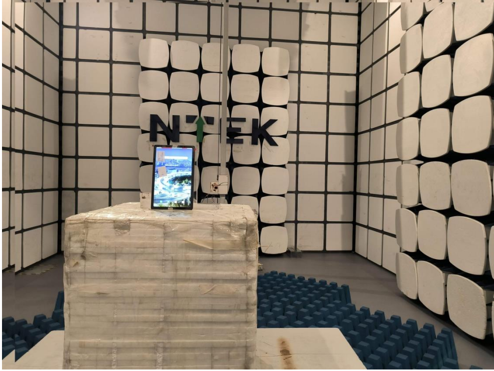
Conducted Measurement Photos