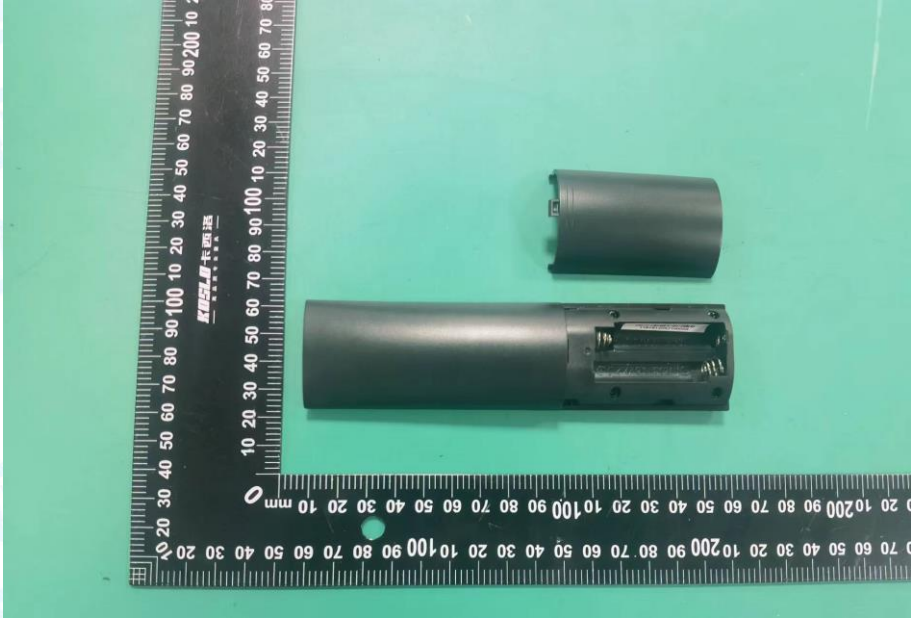
Photo 7 Internal of EUT