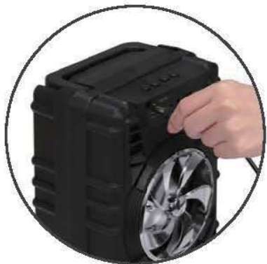
STEP 2 . Connect audio