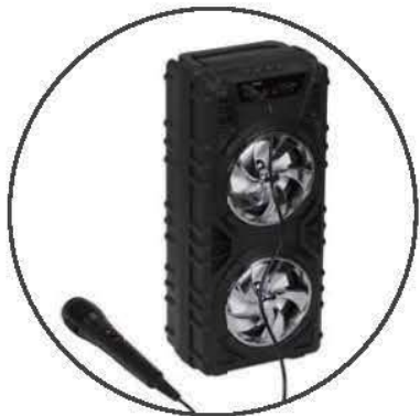
STEP 3 . Finish