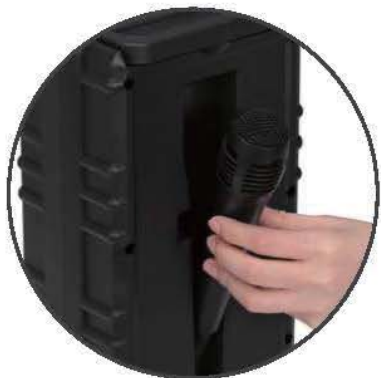
STEP 1 . Take out the microphone