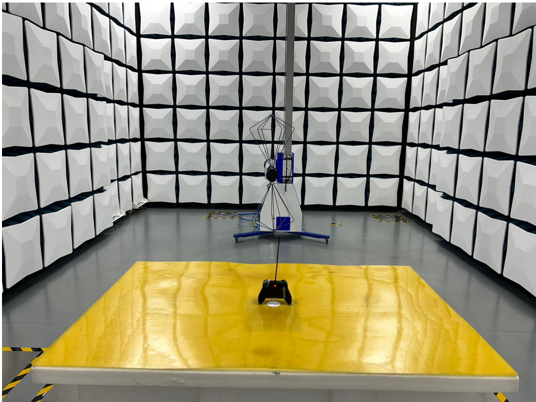
Set-up of Radiation Emission from 30 – 200MHz