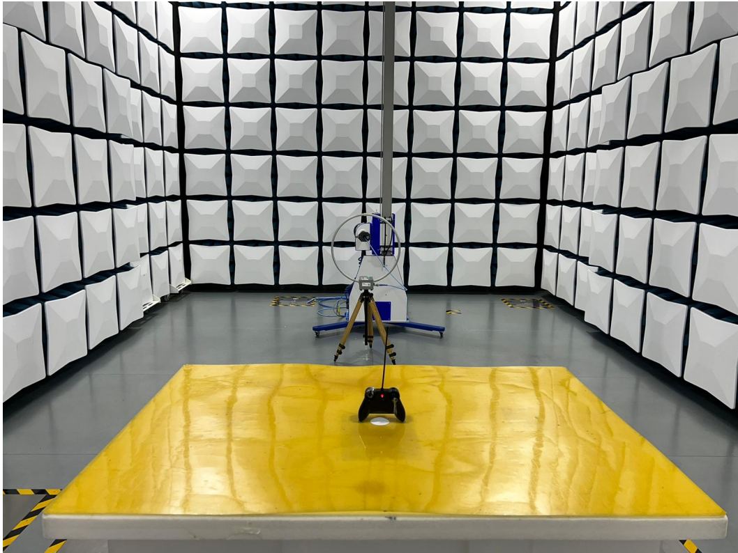
Set-up of Radiation Emission below 30MHz