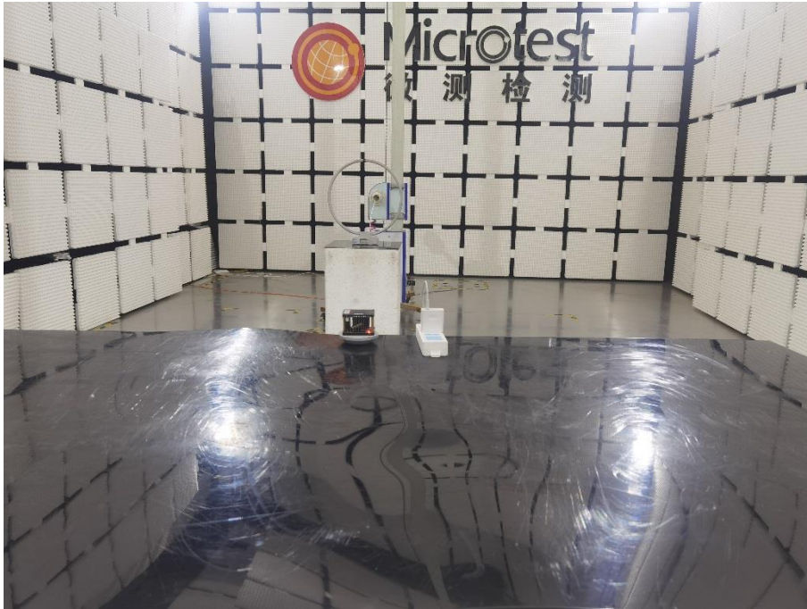
Radiated emissions – Below 1 GHz