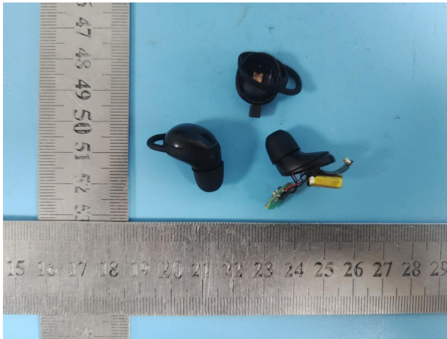
INTERNAL PHOTO OF SAMPLE PCB