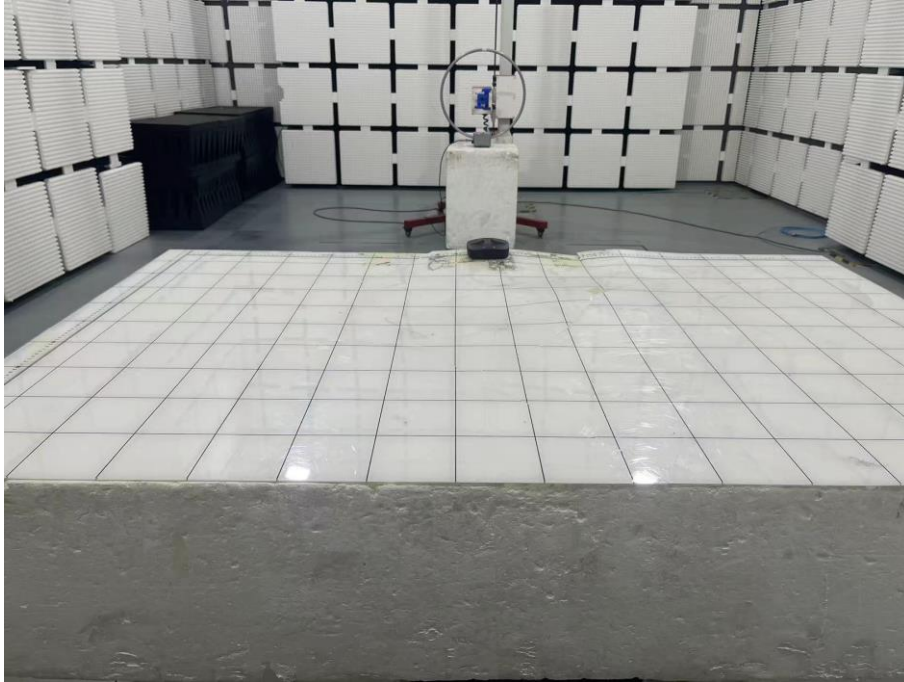
Set-up for Transmitter & Receiver Spurious Emissions, 30MHz to 1000MHz