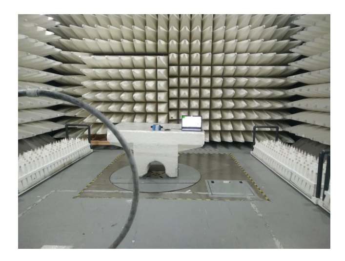
Photograph No.1 Setup for spurious emission field strength measurements in the anechoic chamber below 30 MHz for Sonata Sprint with NFC Reader