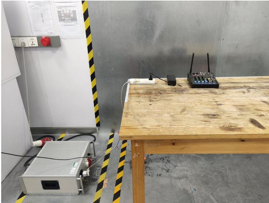
Emissions in frequency bands (below 1GHz)