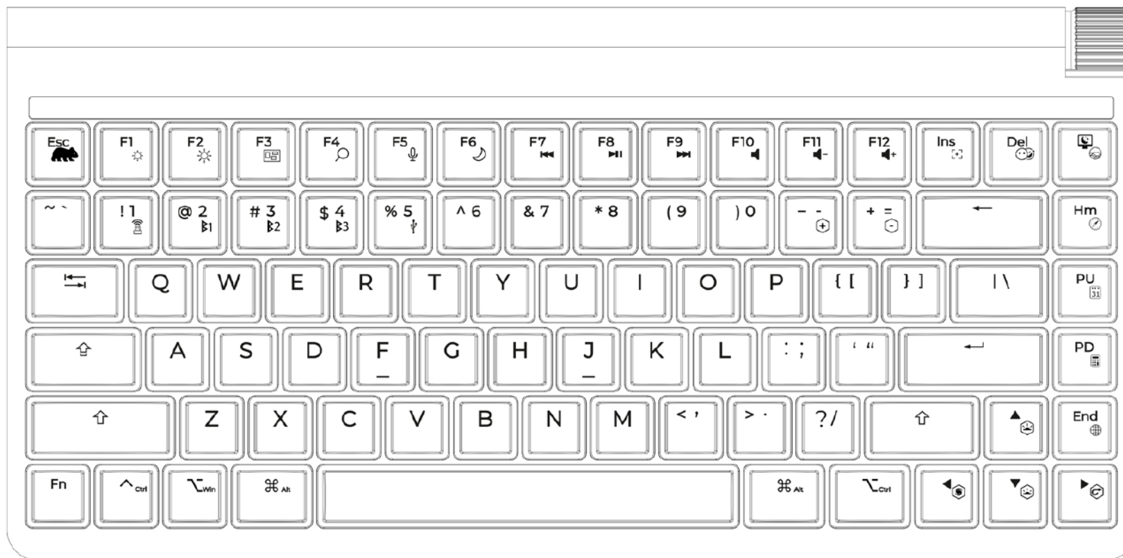
84-key US Layout