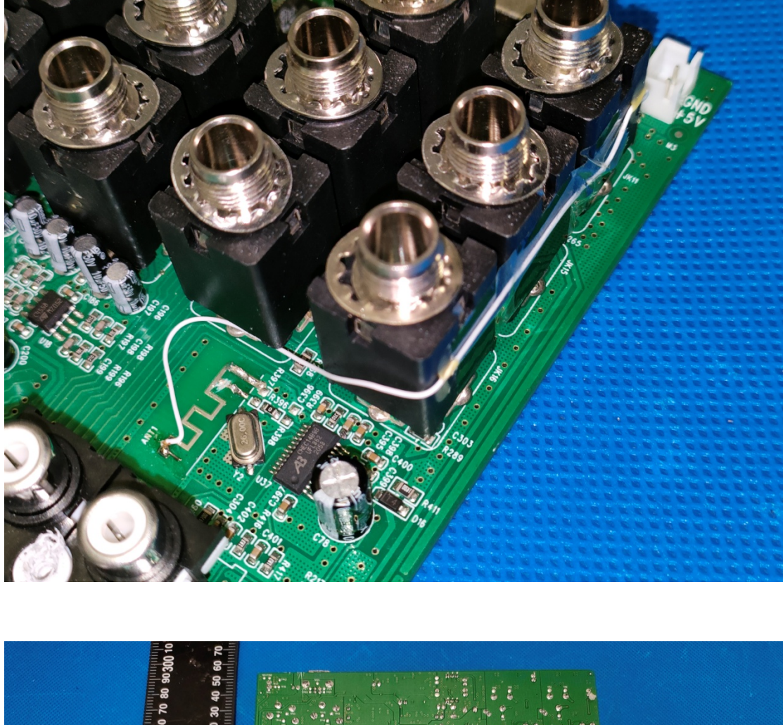
Page 2 of 2