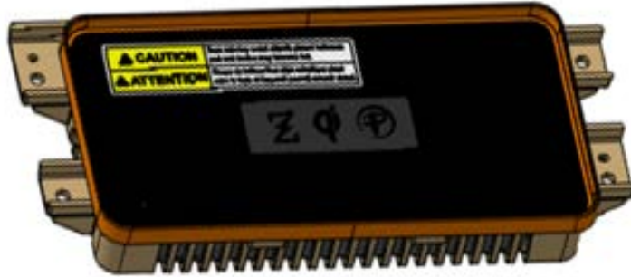
WC900 Wireless charger Unit