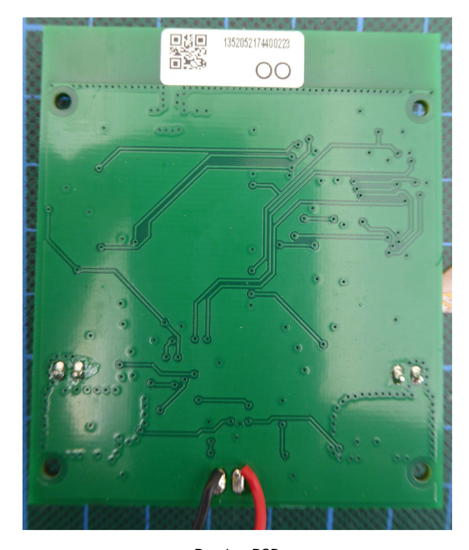
Receiver PCB Bottom view

Examiner: Bernward ROHDE Revision: 00 Date of issue: 16.01.2023 Order Number: 21-111971 page 5 of 5