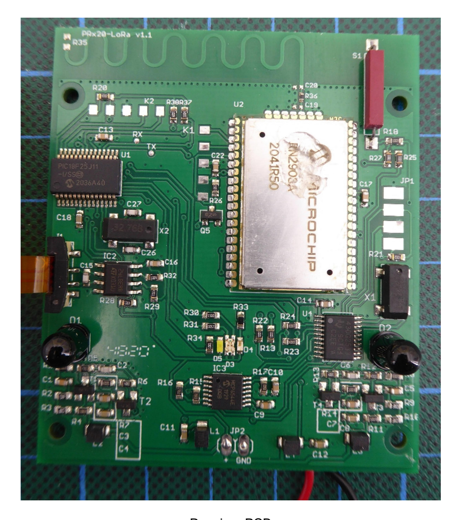
Receiver PCB Top view2 Integrated LoRA-WAN not yet finally labelled

Examiner: Bernward ROHDE Revision: 00 Date of issue: 16.01.2023 Order Number: 21-111971 page 3 of 5