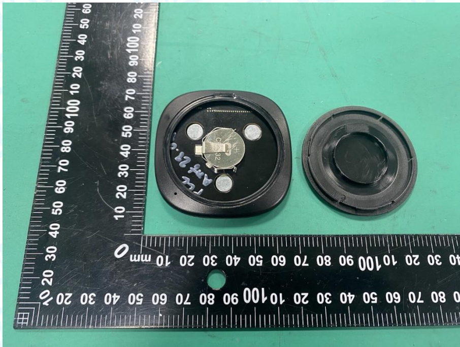
Photo 4 Internal of EUT