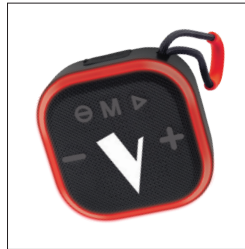
Talent Bluetooth Speaker