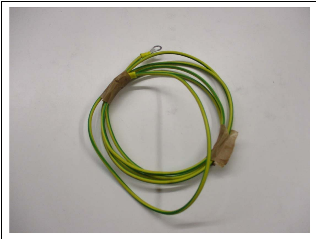
Photograph A3-3: Ground cable

Test on DF Series DF1 plus, DF4 plus, DF3 plus HP plus acc. to 47 CFR §1.1310 and RSS-102 Issue 5