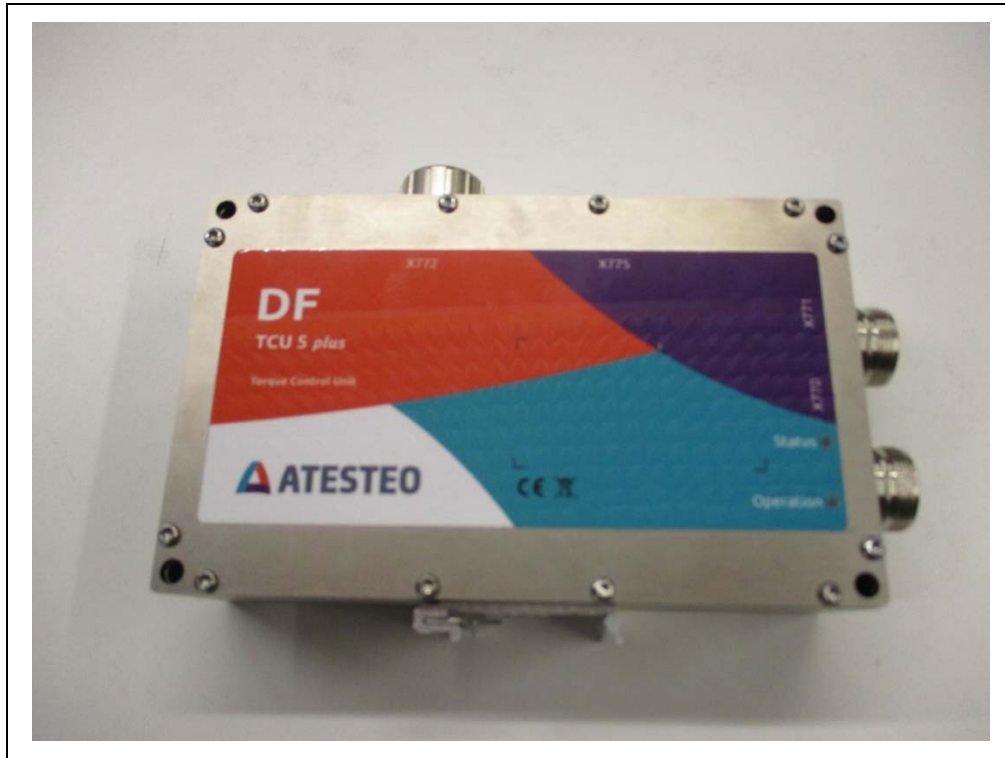
Photograph A3-1: TCU5

Test on DF Series DF1 plus, DF4 plus, DF3 plus HP plus acc. to 47 CFR §1.1310 and RSS-102 Issue 5