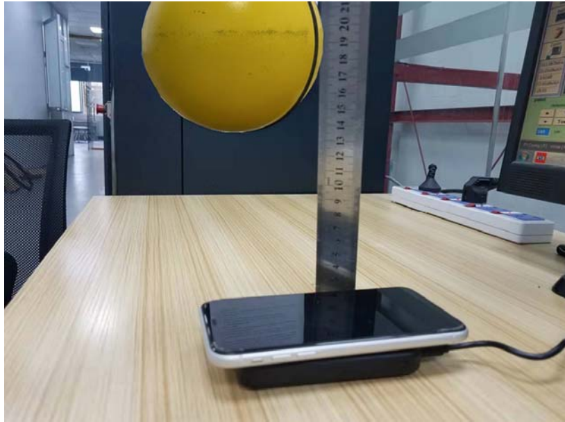
Test Position E