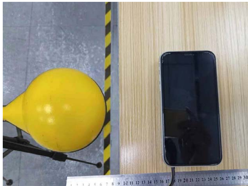
est Position B