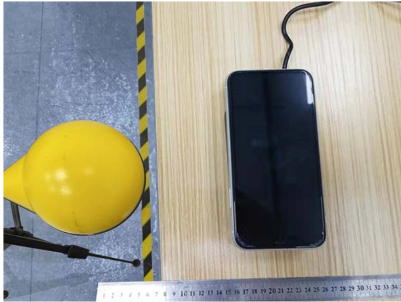
Test Position A-