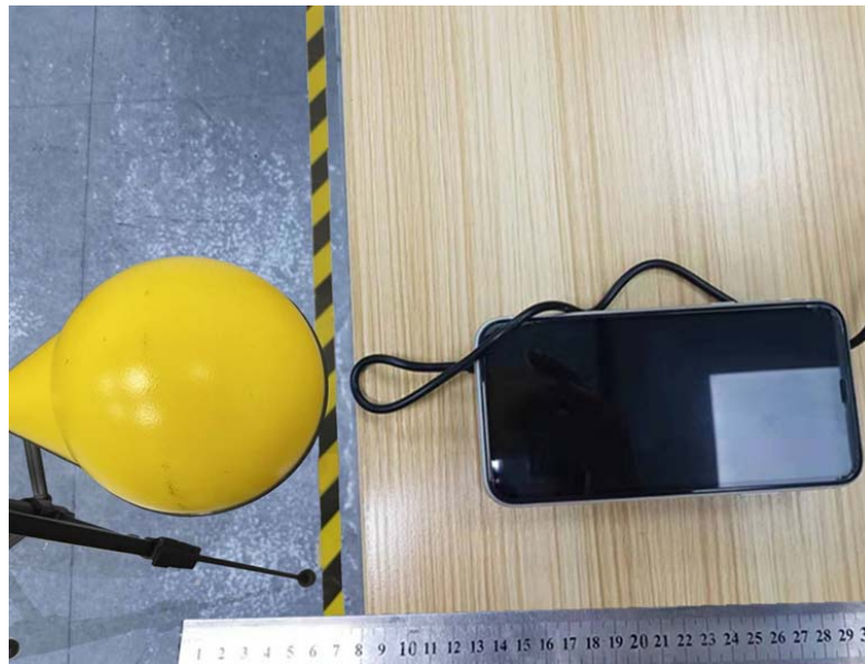
Test Position D