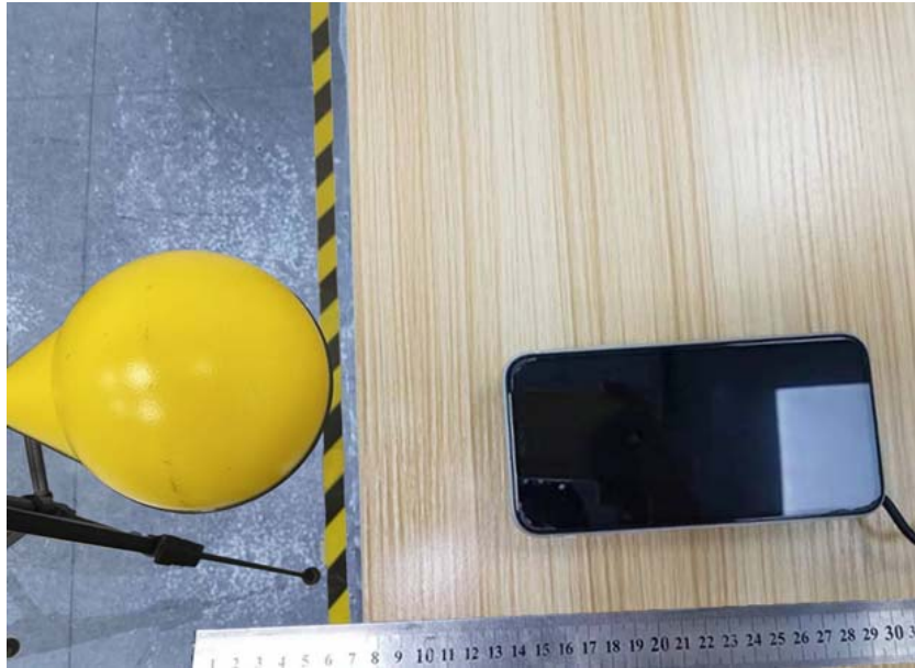
Test Position C