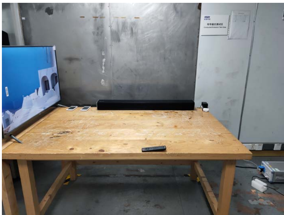
Photo of Power Line Conducted Emission Measurement