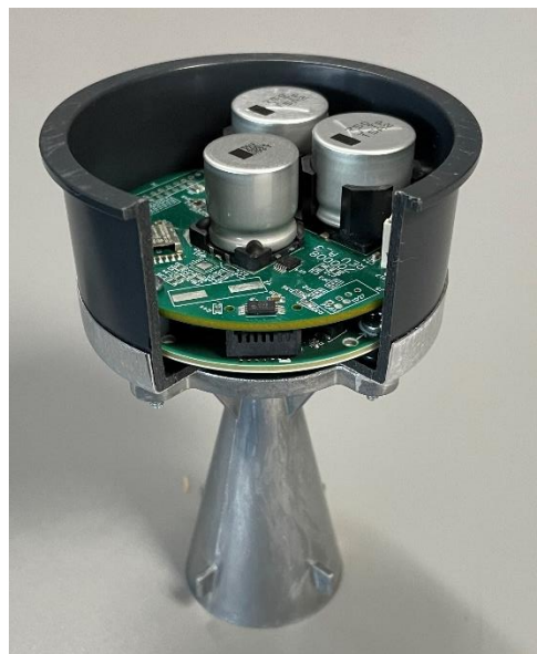
Picture 2- Cut away view of Cup and Horn assembly.