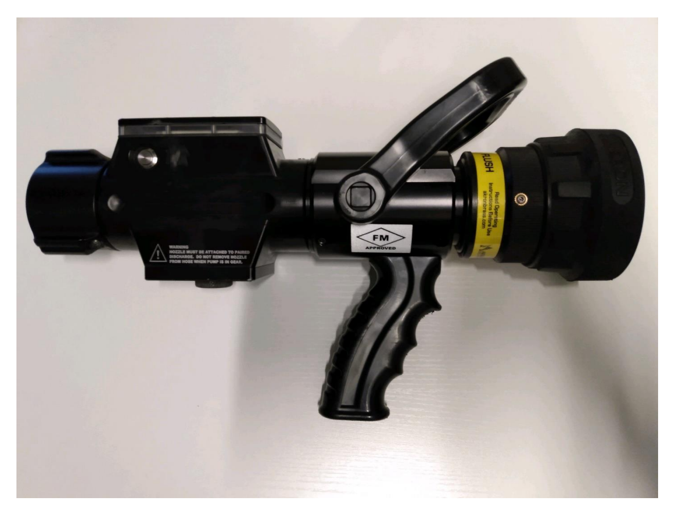
Figure 2 - Fully-assembled 6055 SAM Smart Nozzle, opposing side view