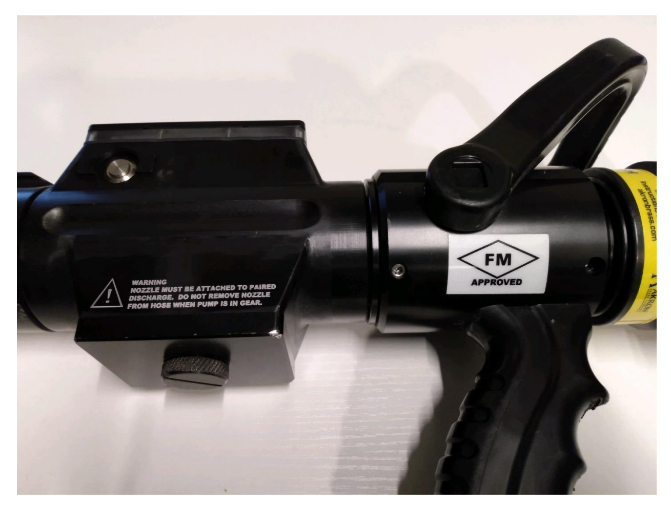
Figure 4 - Fully-assembled 6055 SAM Smart Nozzle, opposing view of sealed battery compartment