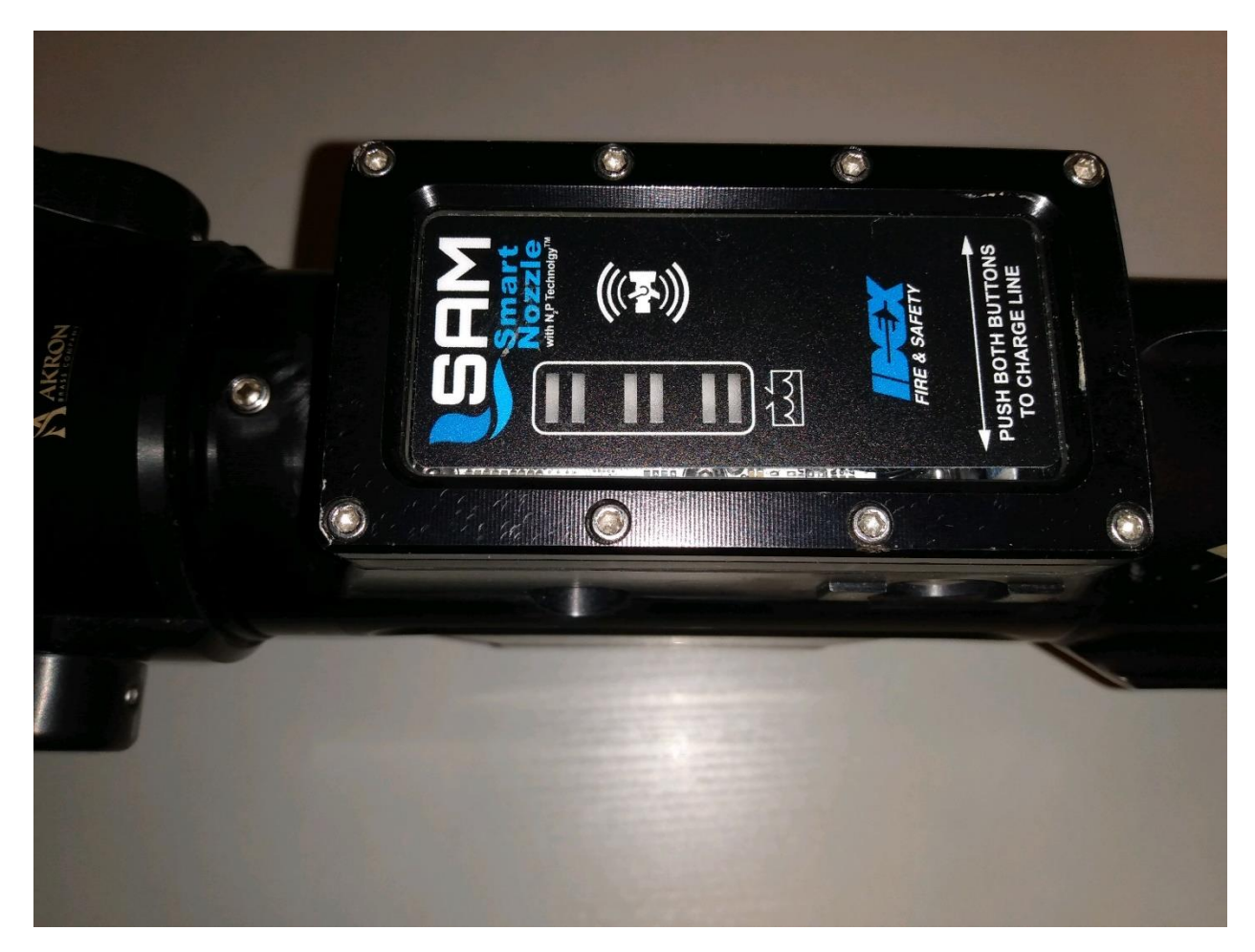
Figure 6 - Fully-assembled 6055 SAM Smart Nozzle, top view close-up