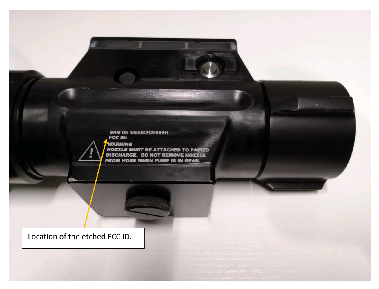
Figure 3 - Fully-assembled 6055 SAM Smart Nozzle, view of sealed battery compartment