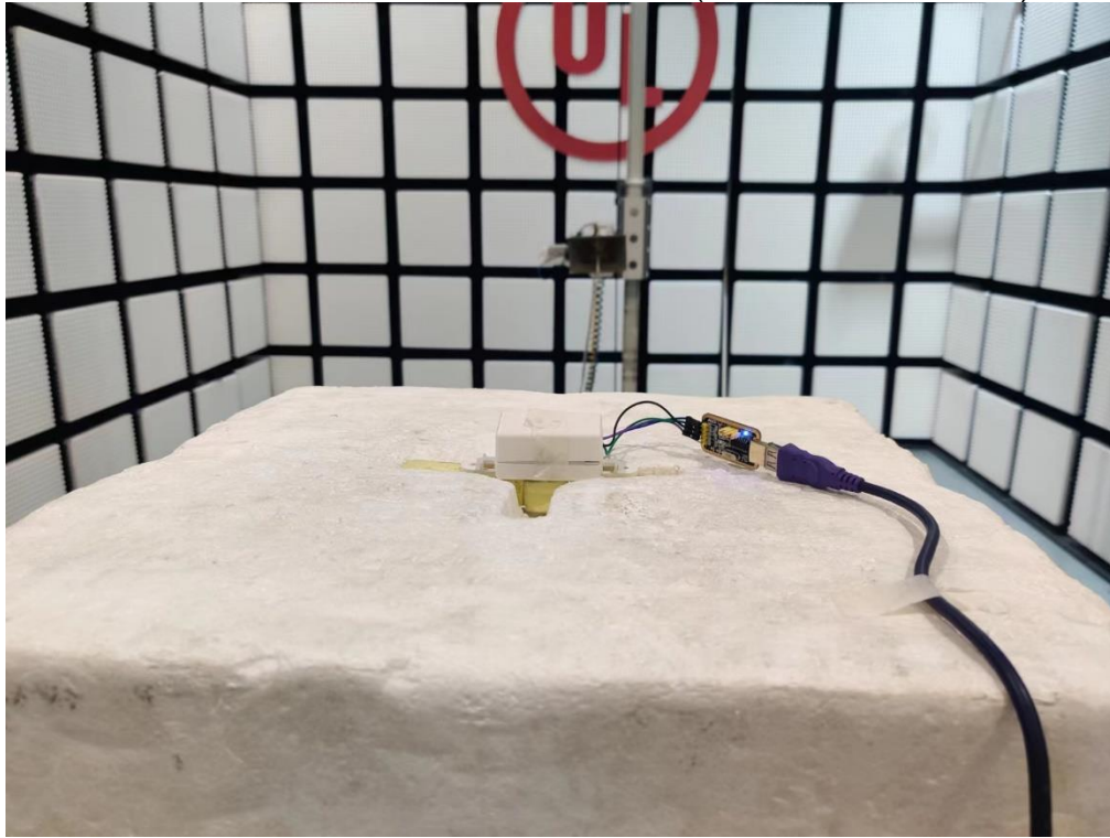
RADIATED RF MEASUREMENT SETUP (Above 1 GHz – Y axis)