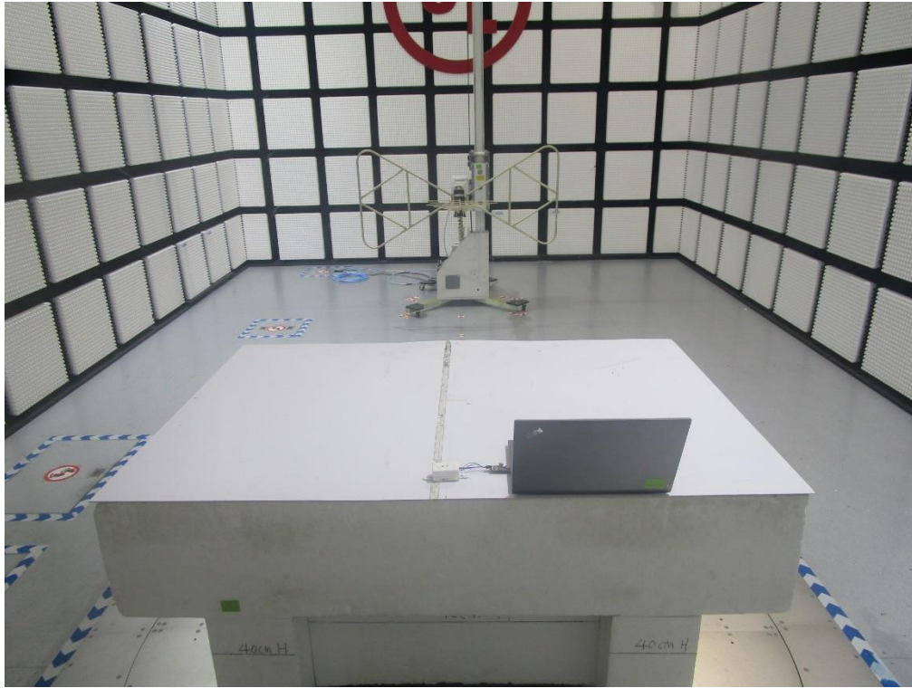
Radiated Disturbance Below 30 MHz