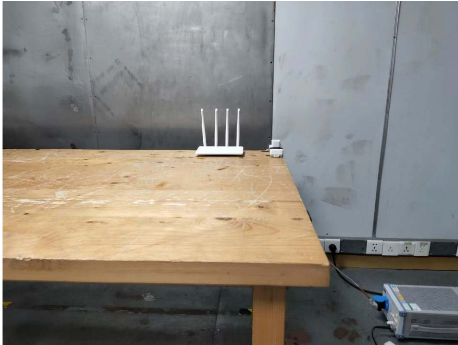
Photo of Power Line Conducted Emission Measurement