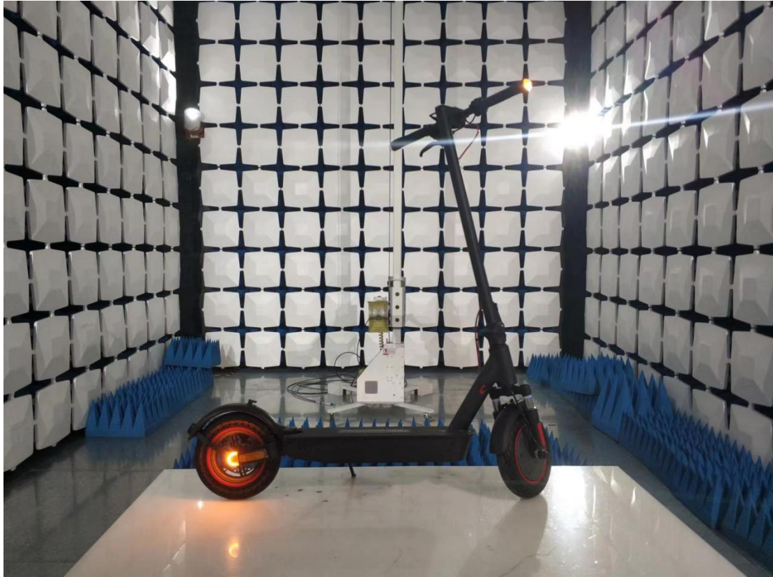
Conducted emission test setup