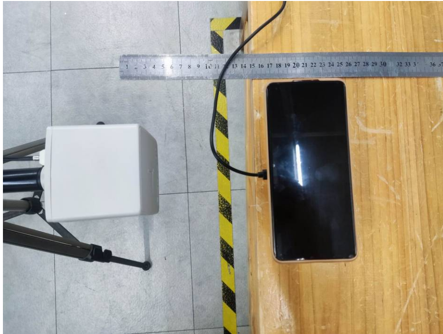
Test Position C-15cm from the edge of EUT to the geometric center of the probe