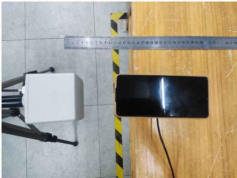
Test Position D-15cm from the edge of EUT to the geometric center of the probe