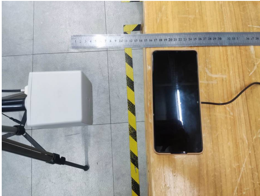
Test Position A-15cm from the edge of EUT to the geometric center of the probe