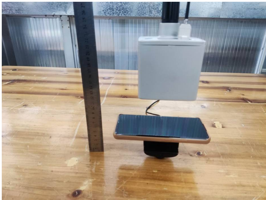
Test Position F-20cm from the edge of EUT to the geometric center of the probe