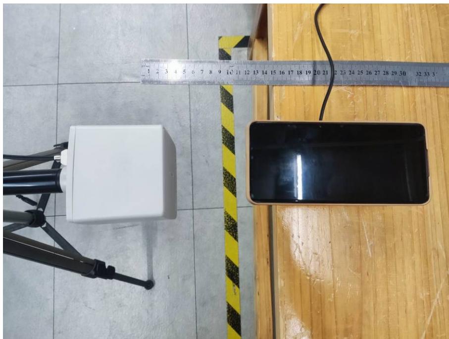
Test Position B-15cm from the edge of EUT to the geometric center of the probe