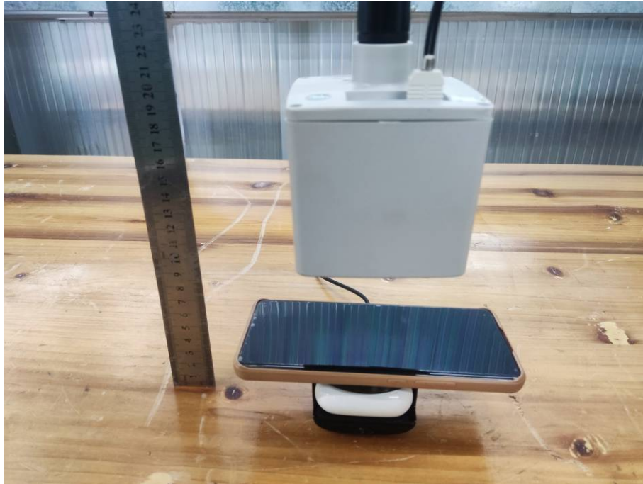
Test Position E-15cm from the edge of EUT to the geometric center of the probe