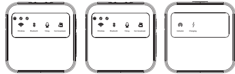
(Microphone emitter) (Microphone emitter) (Microphone receiver)

The product is smart wireless recording microphone that can provide professional recording live streaming output. It is plug-and-play type, which requires no APP. Multiple purposes: Network broadcast, Vlog shooting, program interview, interview recording and video teaching.