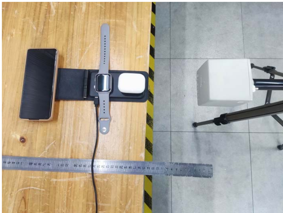
Test Position D-15cm from the edge of EUT to the geometric center of the probe