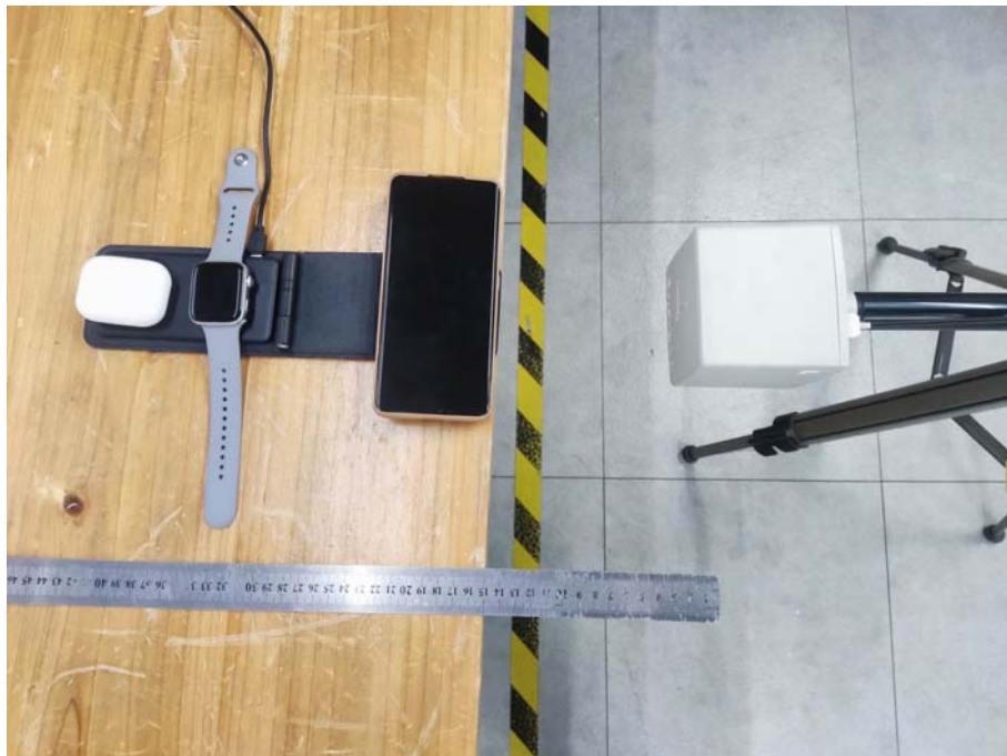
Test Position B-15cm from the edge of EUT to the geometric center of the probe