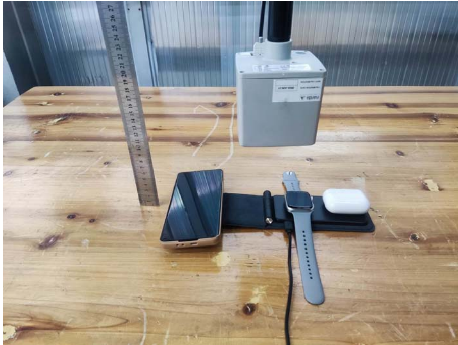
Test Position E-15cm from the edge of EUT to the geometric center of the probe