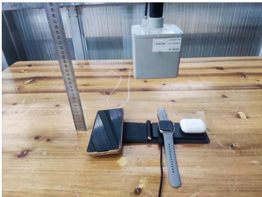
Test Position F-20cm from the edge of EUT to the geometric center of the probe