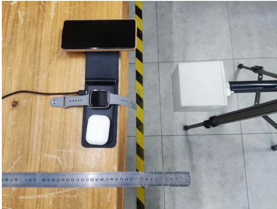
Test Position A-15cm from the edge of EUT to the geometric center of the probe