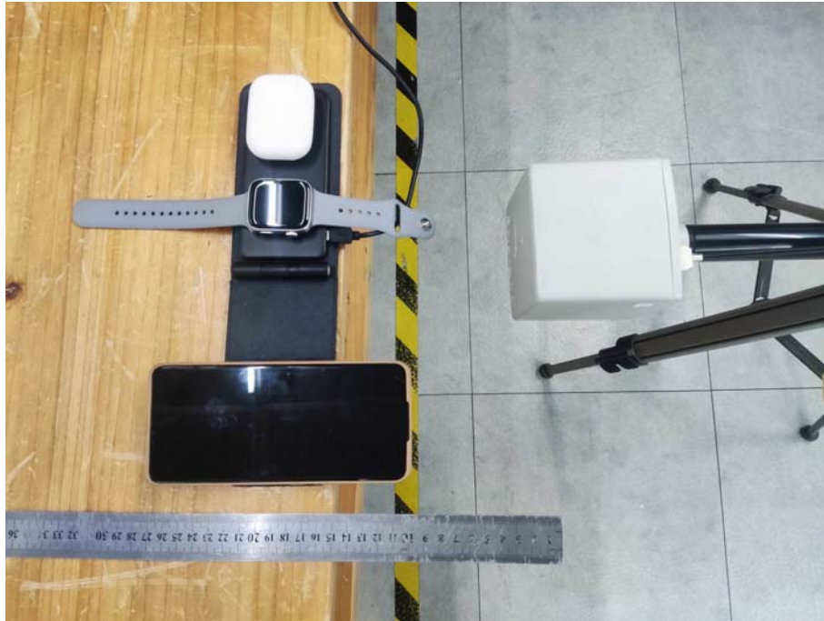
Test Position C-15cm from the edge of EUT to the geometric center of the probe