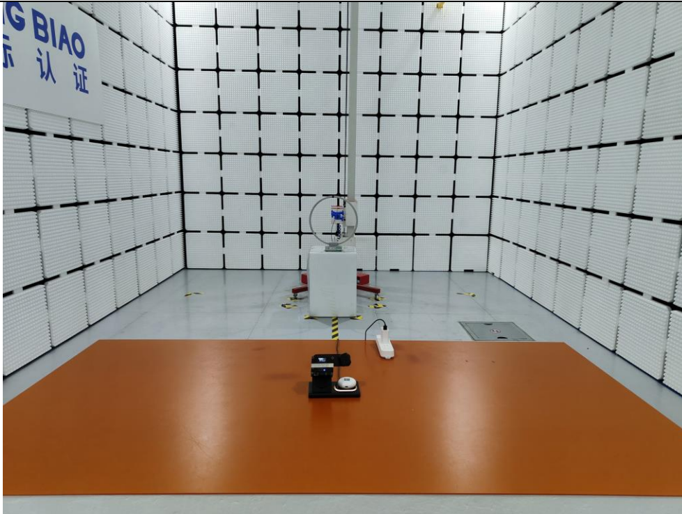
Radiated Emission Below 1000MHz