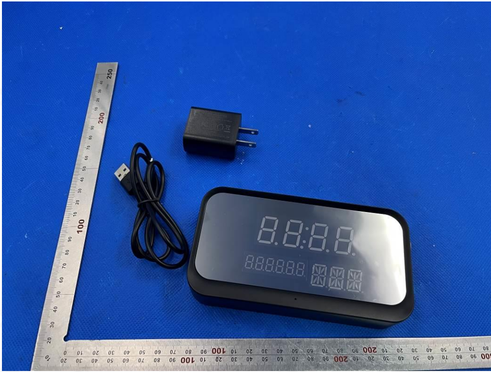
TOP VIEW OF EUT