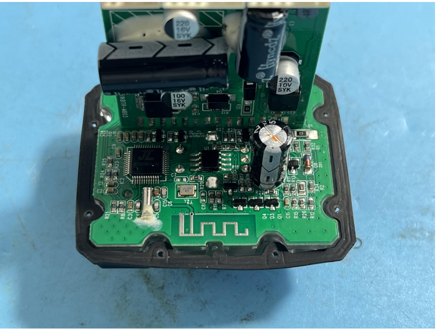
INTERNAL PHOTO OF SAMPLE PCB