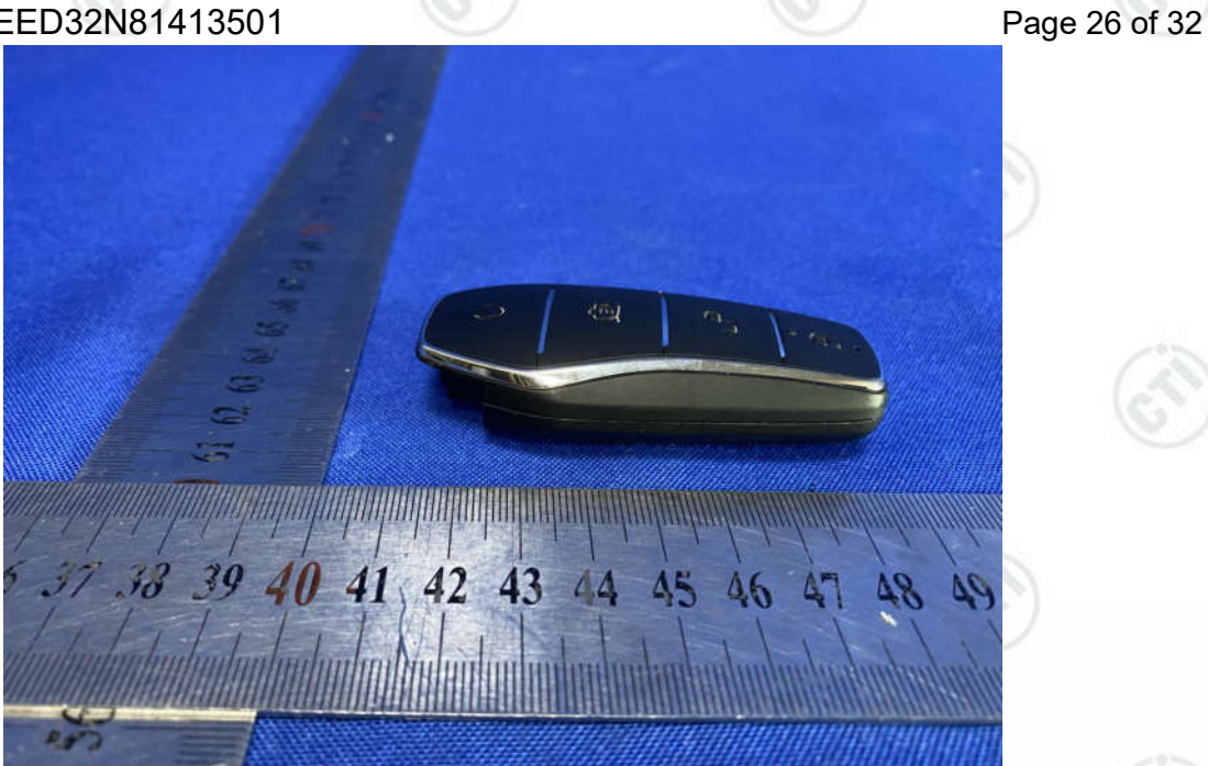
View of Product-5