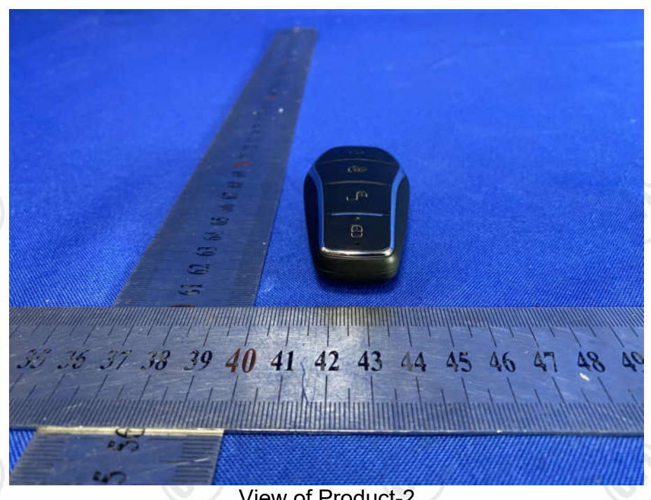
View of Product-2