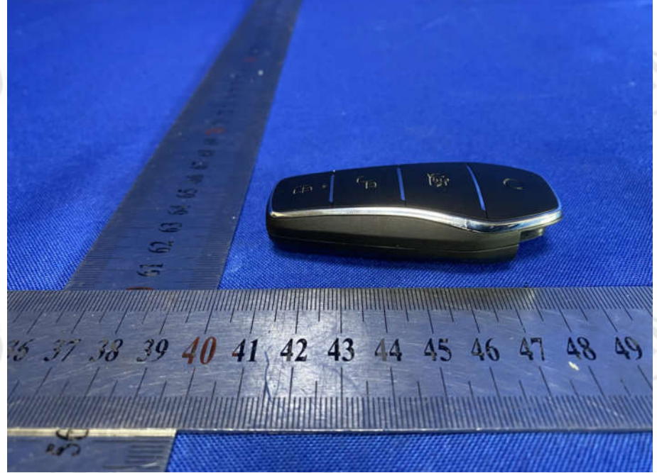
View of Product-3