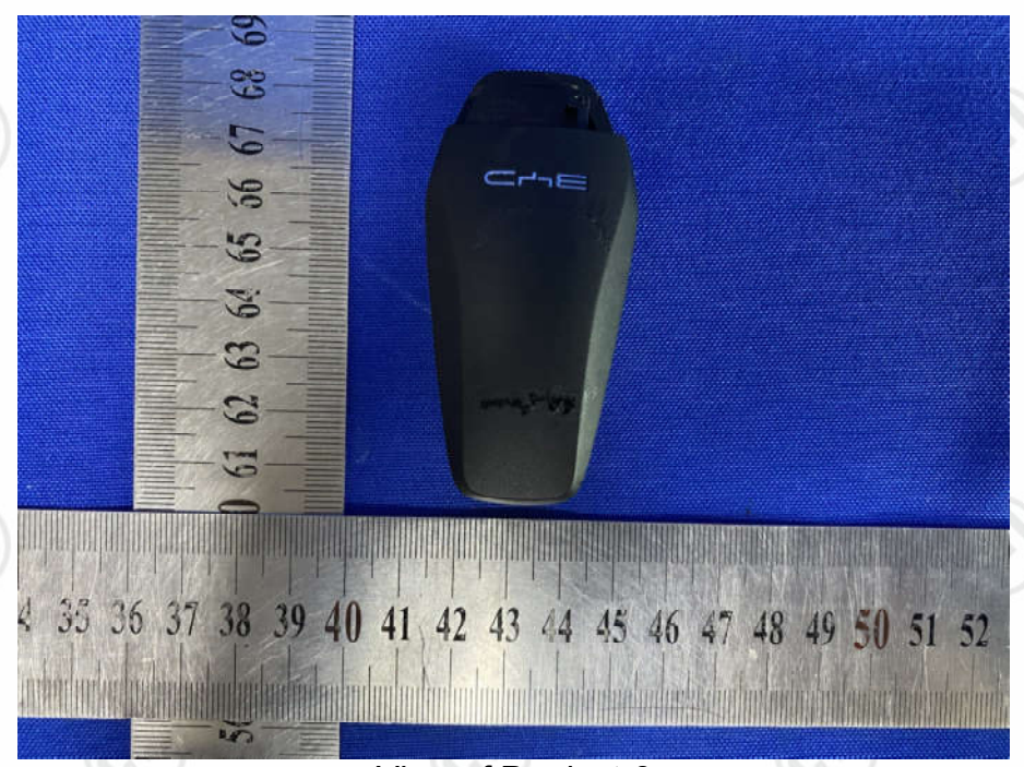
View of Product-6