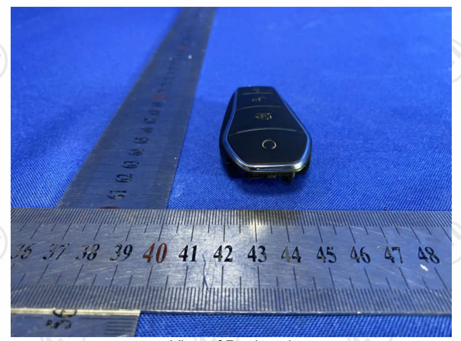
View of Product-4