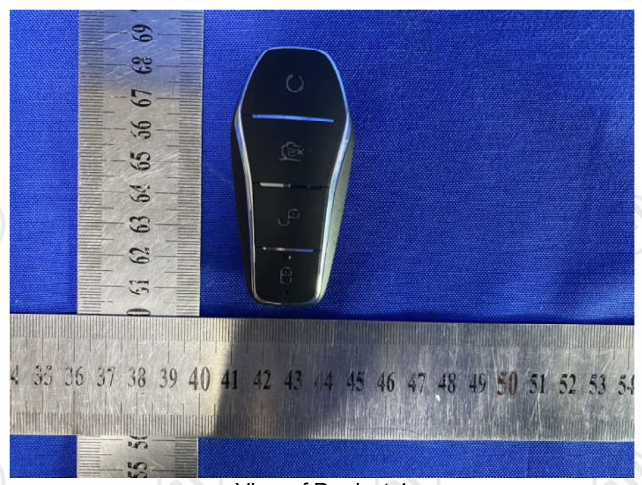
View of Product-1