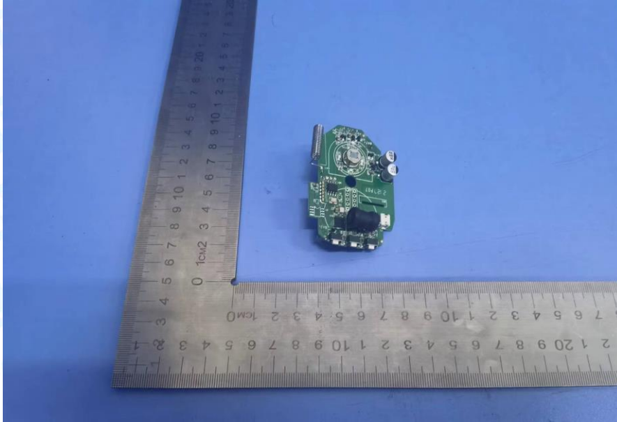
Photo 12 Appearance of PCB