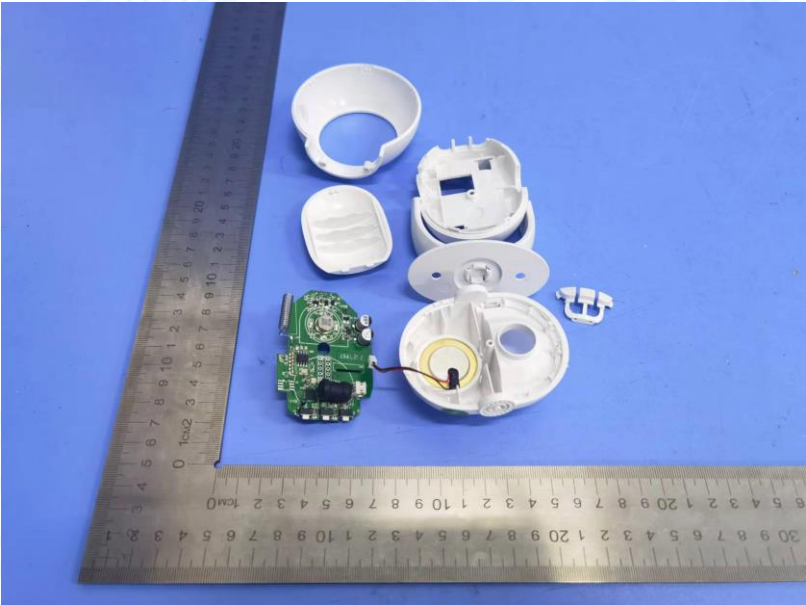
Photo 10 Appearance of PCB