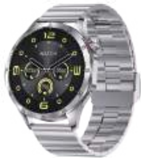
TECHNOLOGY INSPIRES LIFE