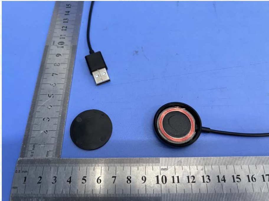
Photo 7 Internal of EUT