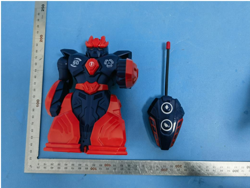
ALL VIEW OF EUT-2