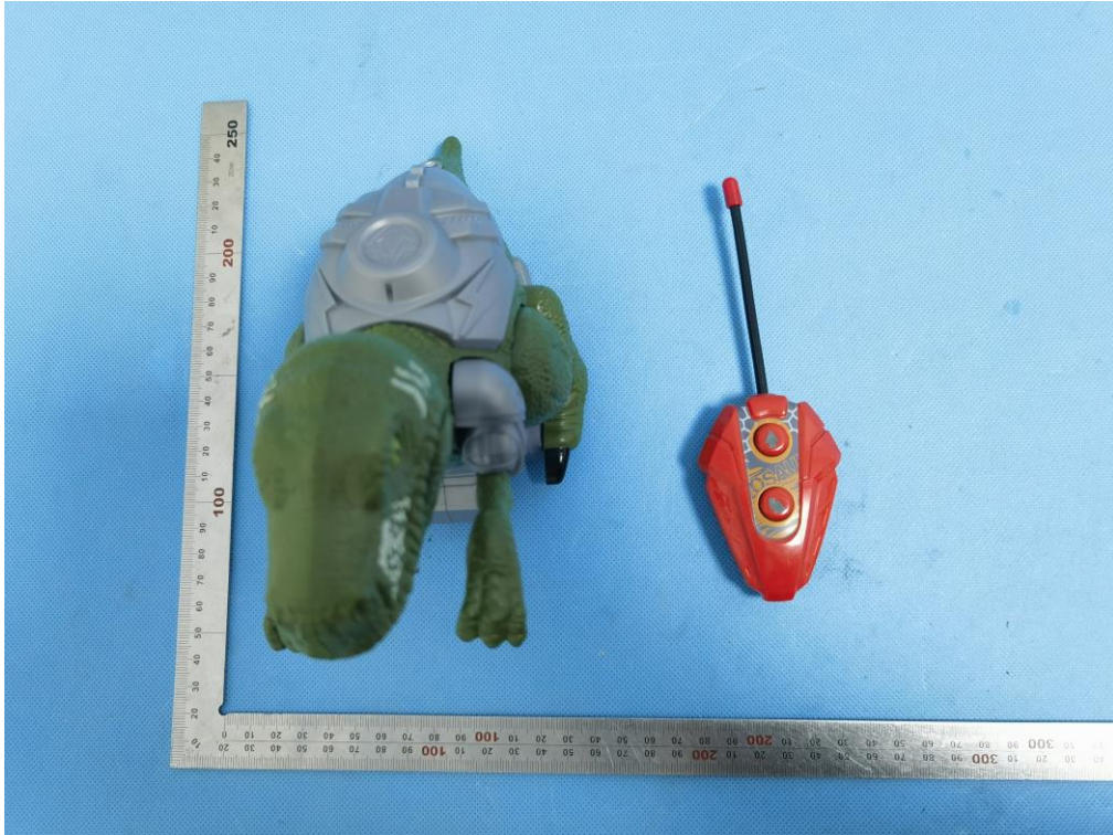
ALL VIEW OF EUT-4