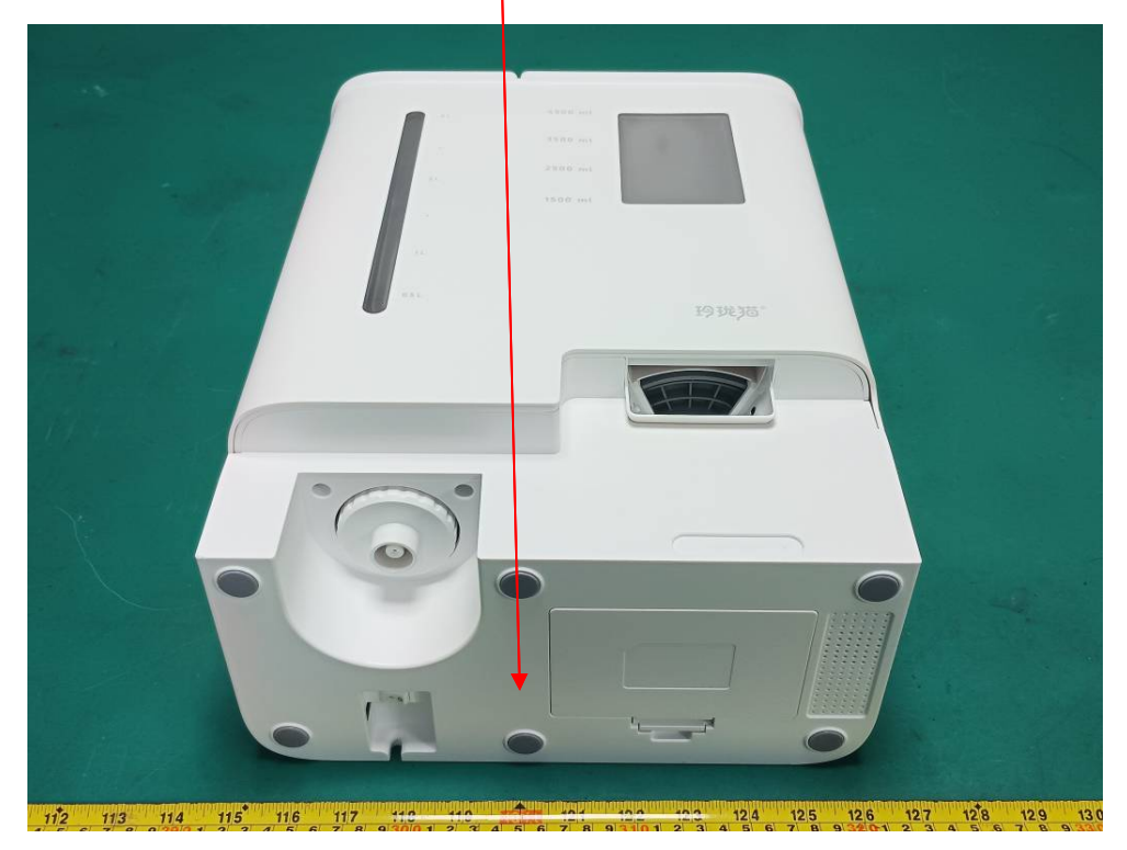
FCC ID Label Location Information