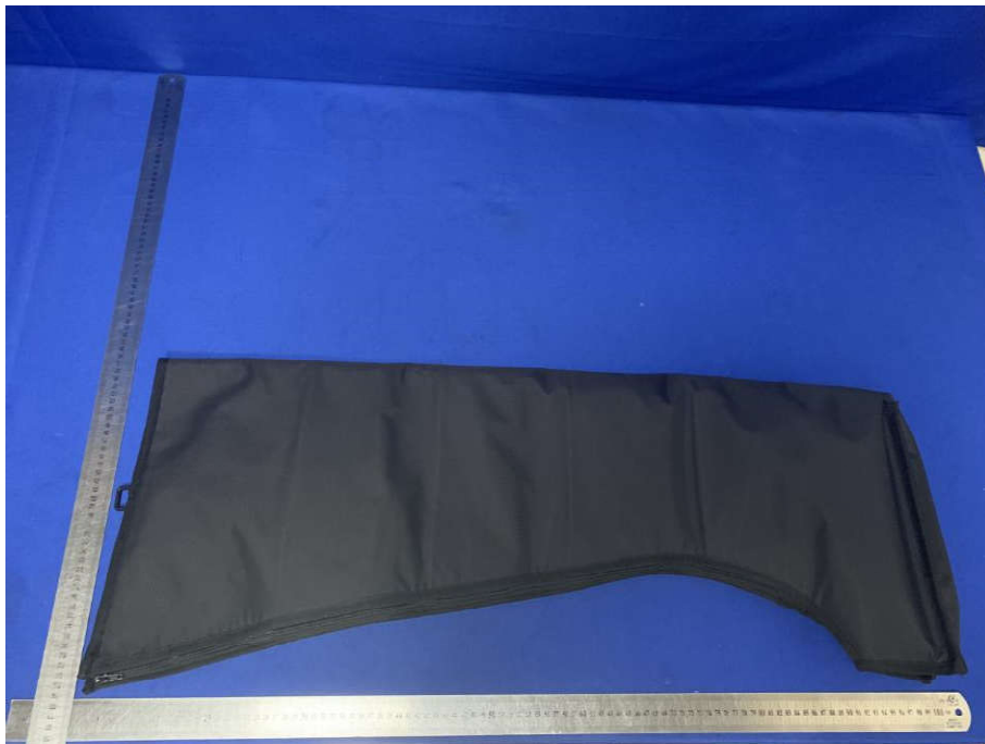
View of Product-7