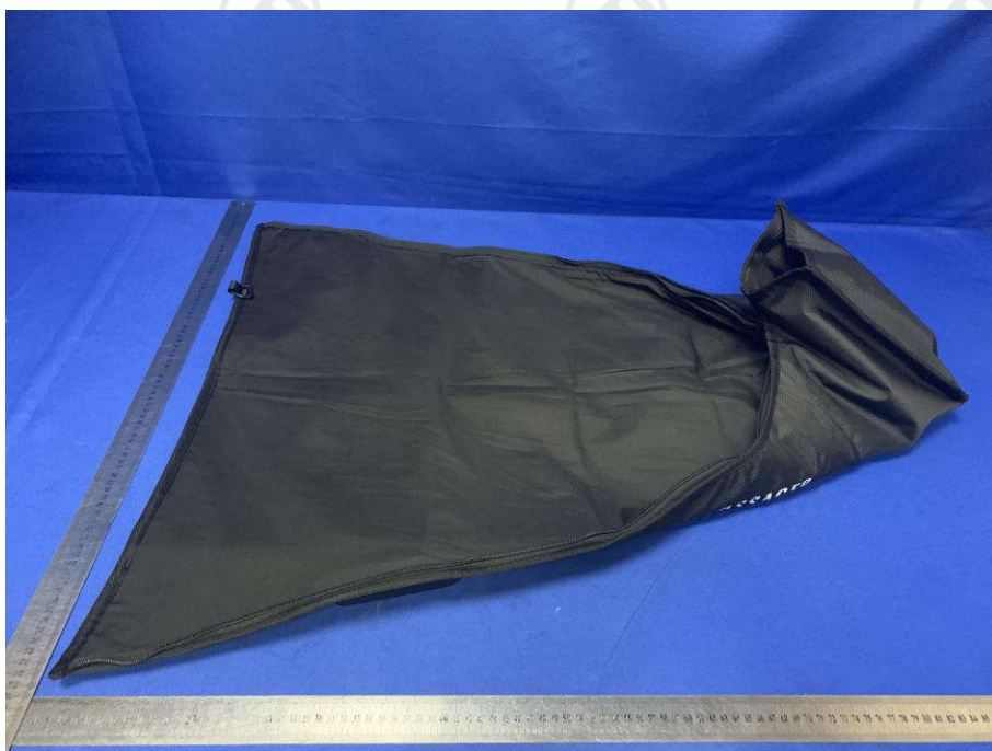
View of Product-8