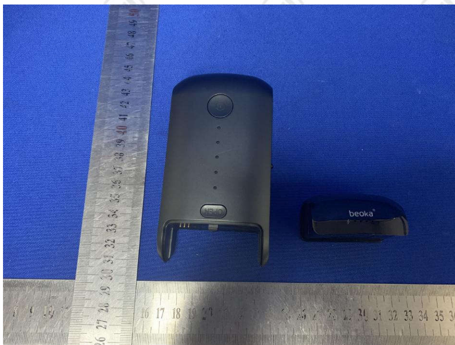
View of Product-14