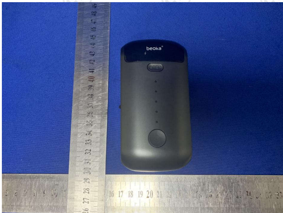
View of Product-12