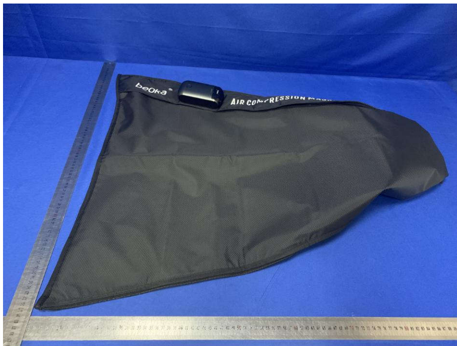
View of Product-9