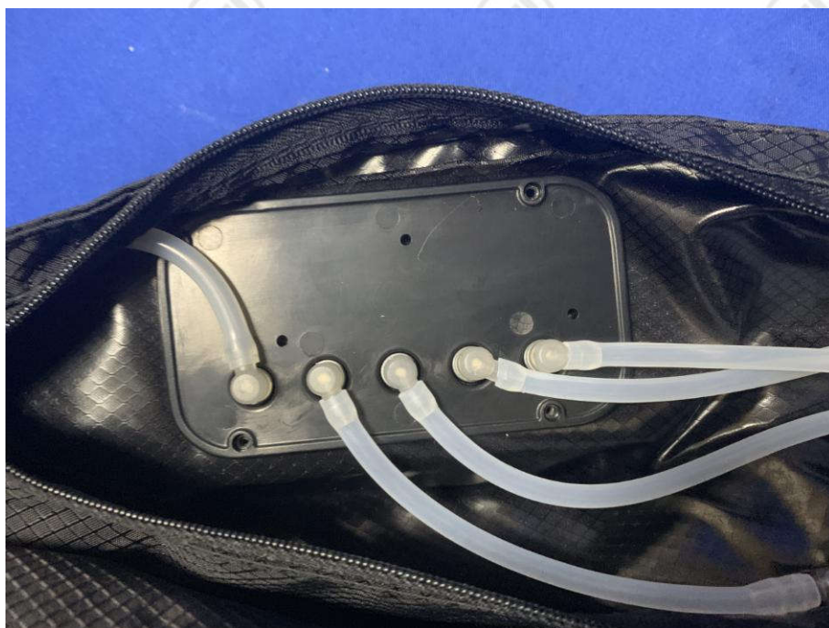
View of Product-10