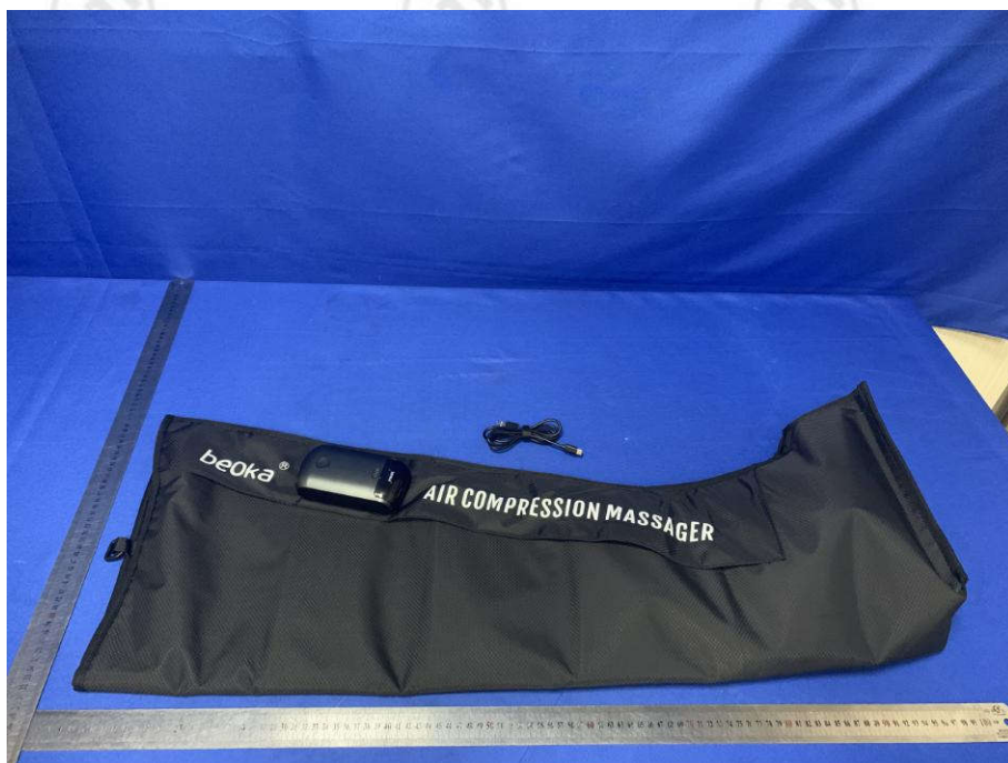
View of Product-1