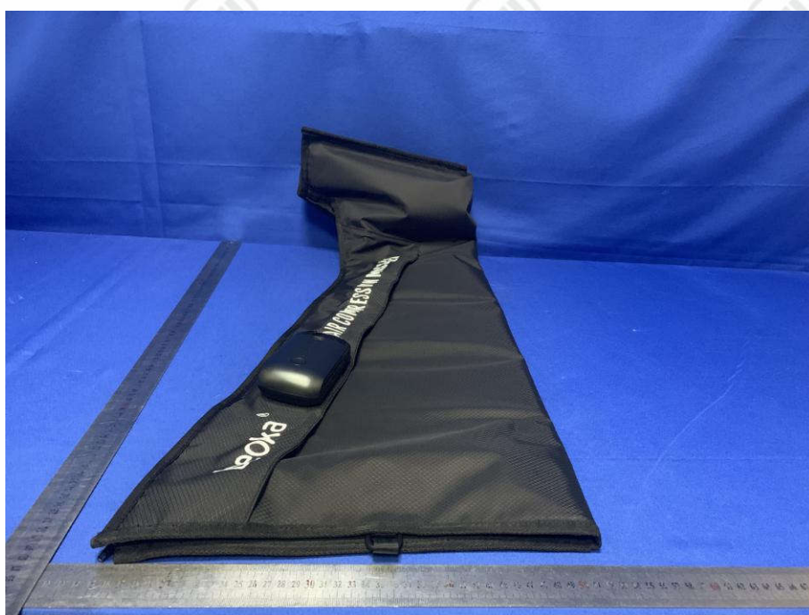
View of Product-4