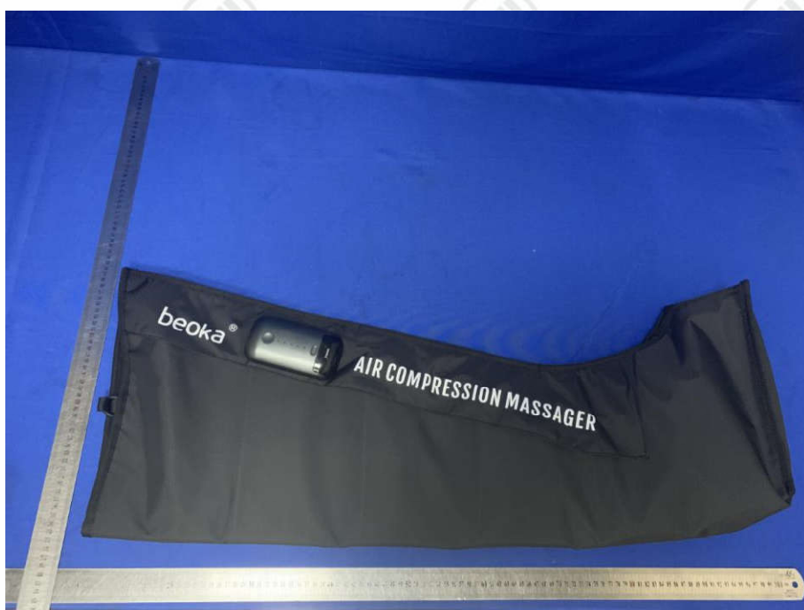
View of Product-6