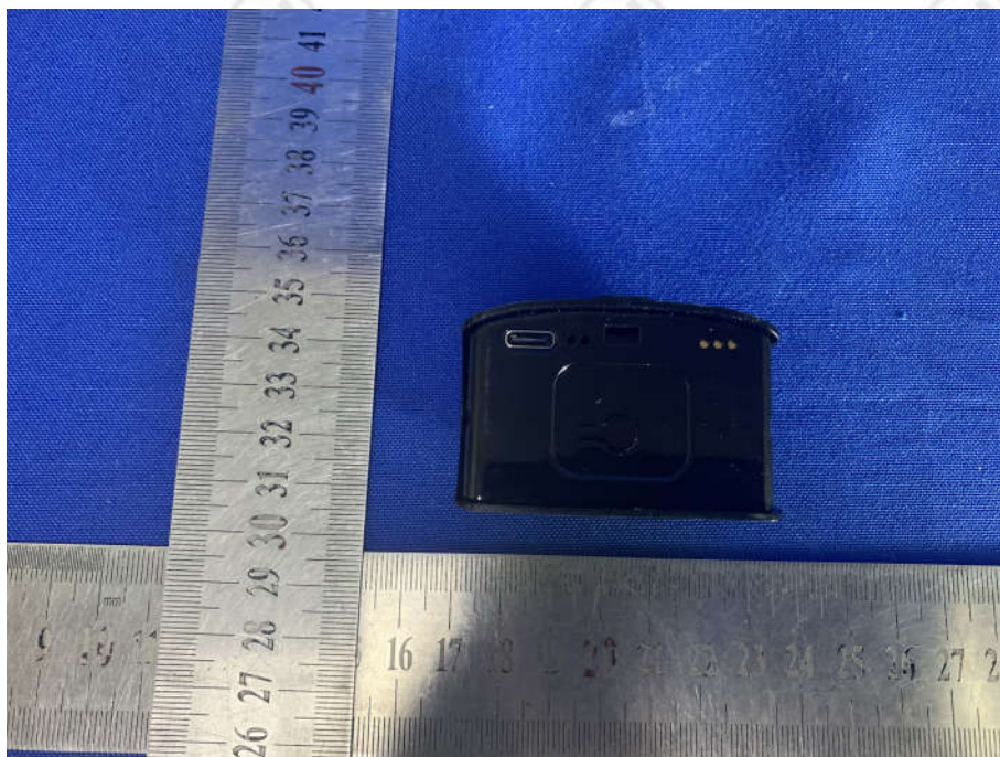
View of Product-15