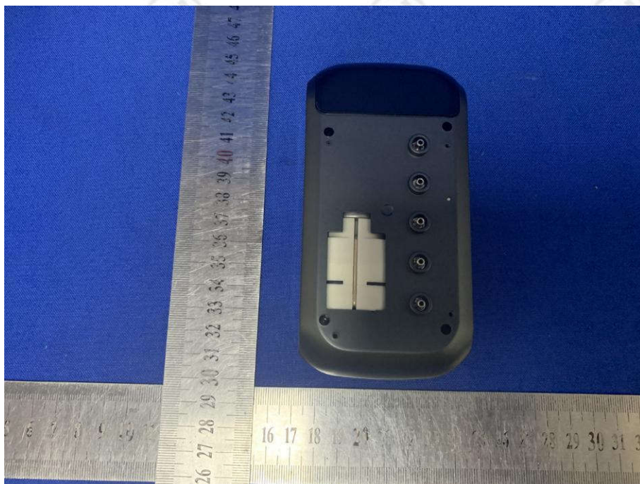
View of Product-13