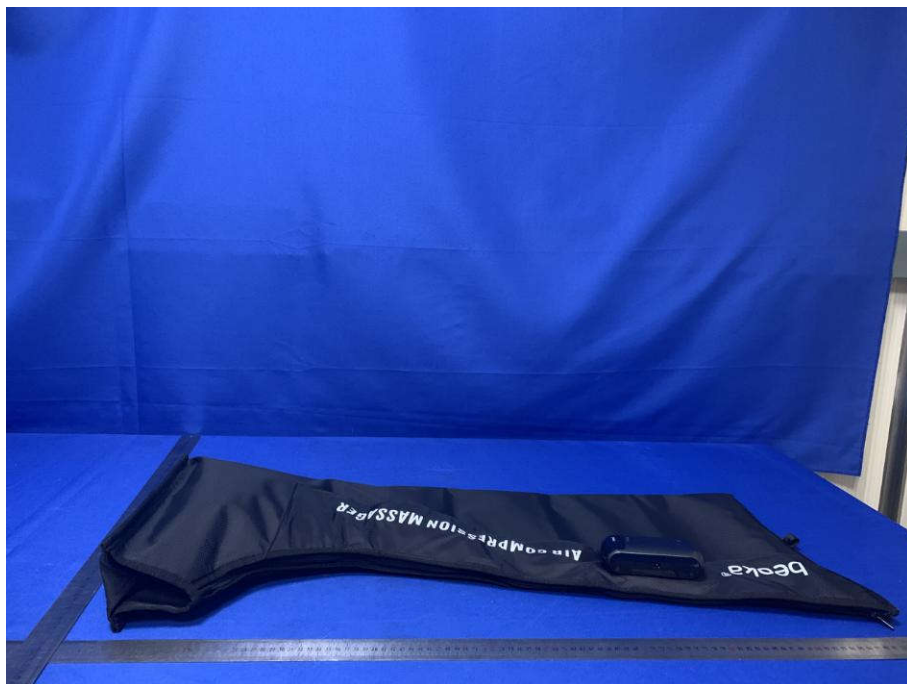
View of Product-3