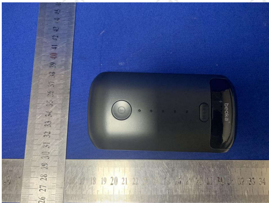
View of Product-11