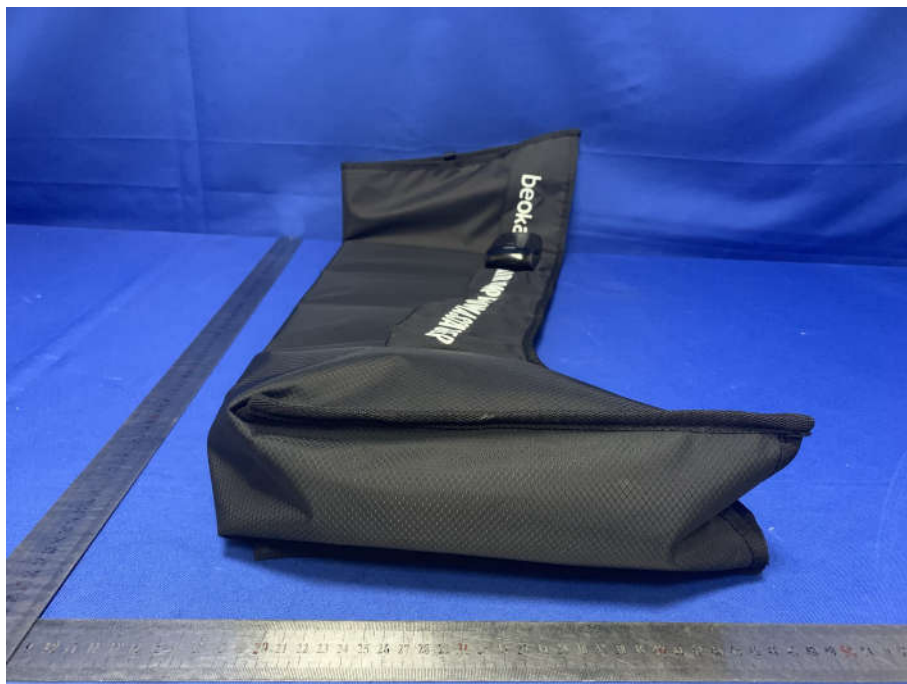
View of Product-5