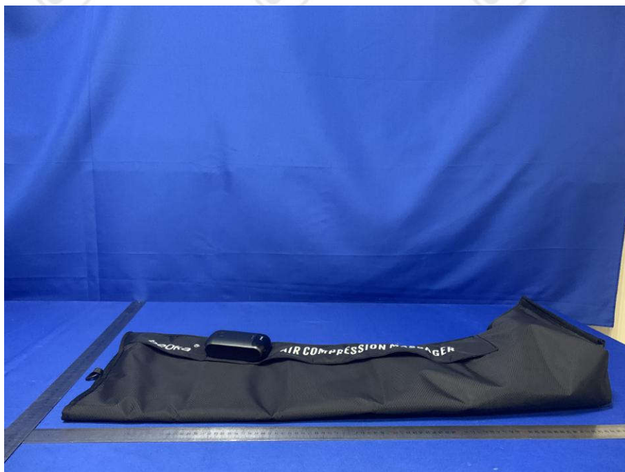
View of Product-2