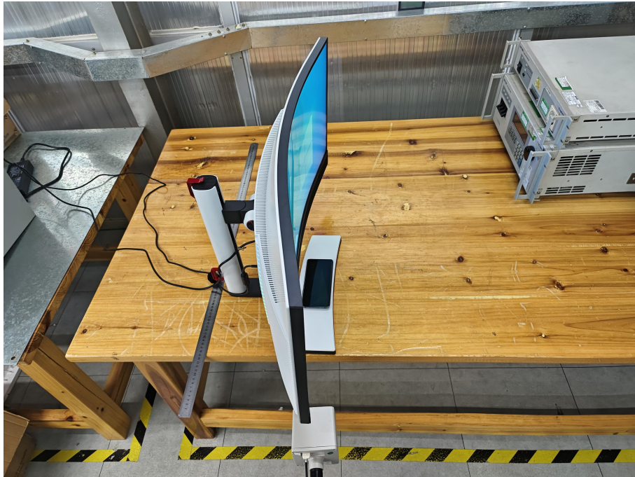
Test Position C-15cm from the edge of EUT to the geometric center of the probe