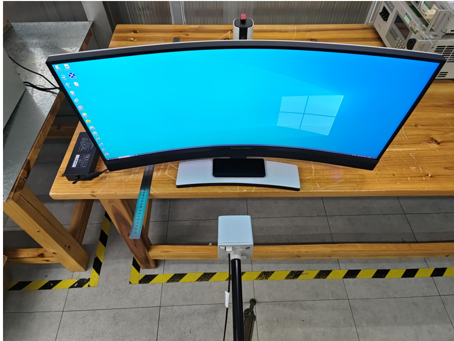
Test Position A-15cm from the edge of EUT to the geometric center of the probe