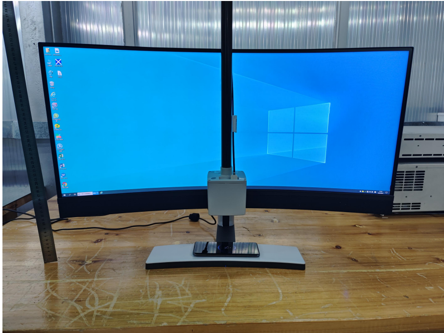
Test Position E-15cm from the edge of EUT to the geometric center of the probe