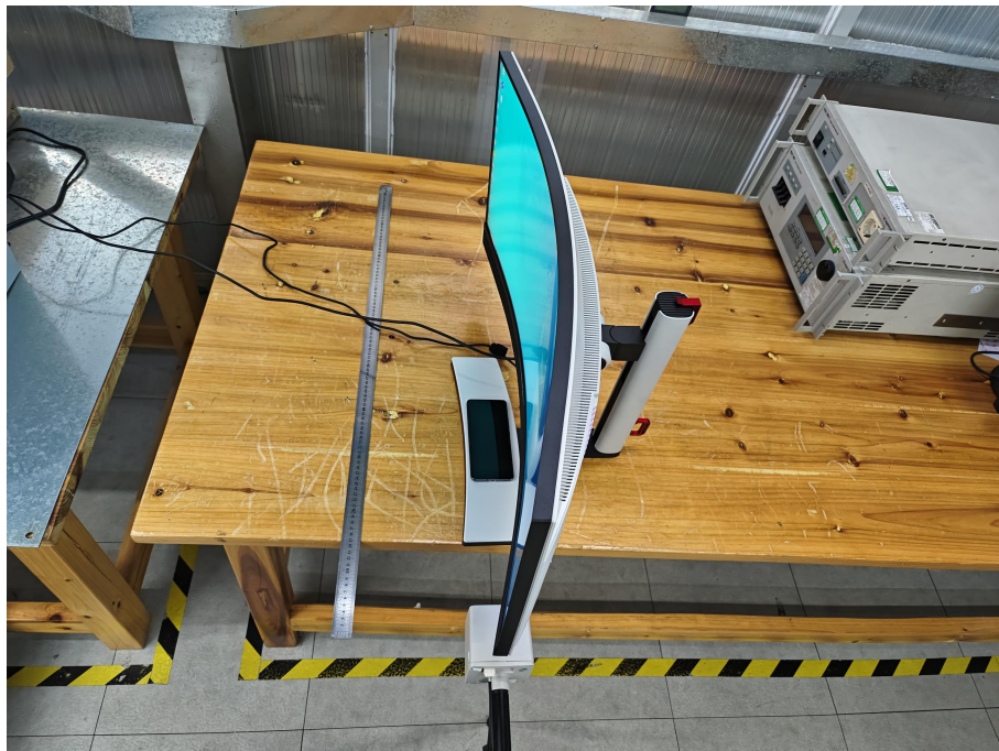
Test Position B-15cm from the edge of EUT to the geometric center of the probe