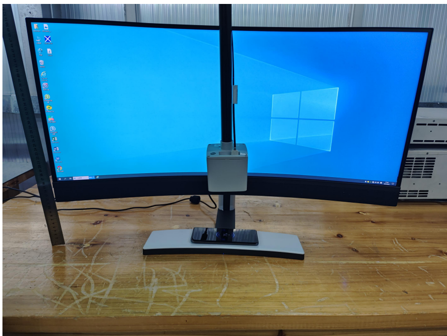
Test Position F-20cm from the edge of EUT to the geometric center of the probe