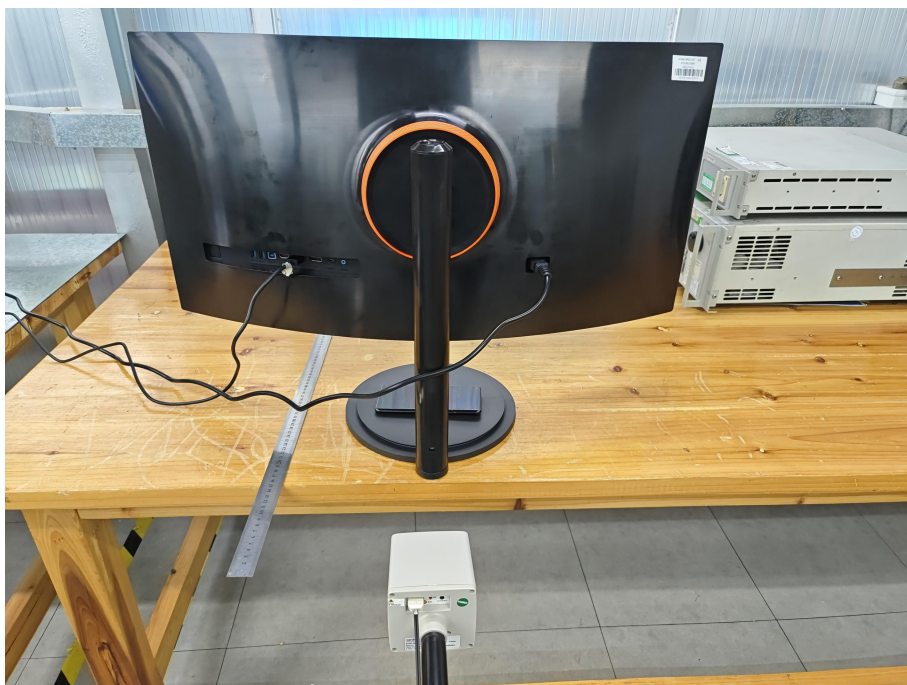
Test Position D-15cm from the edge of EUT to the geometric center of the probe