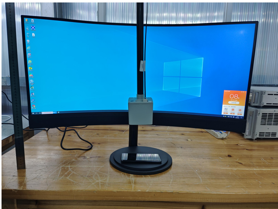
Test Position F-20cm from the edge of EUT to the geometric center of the probe