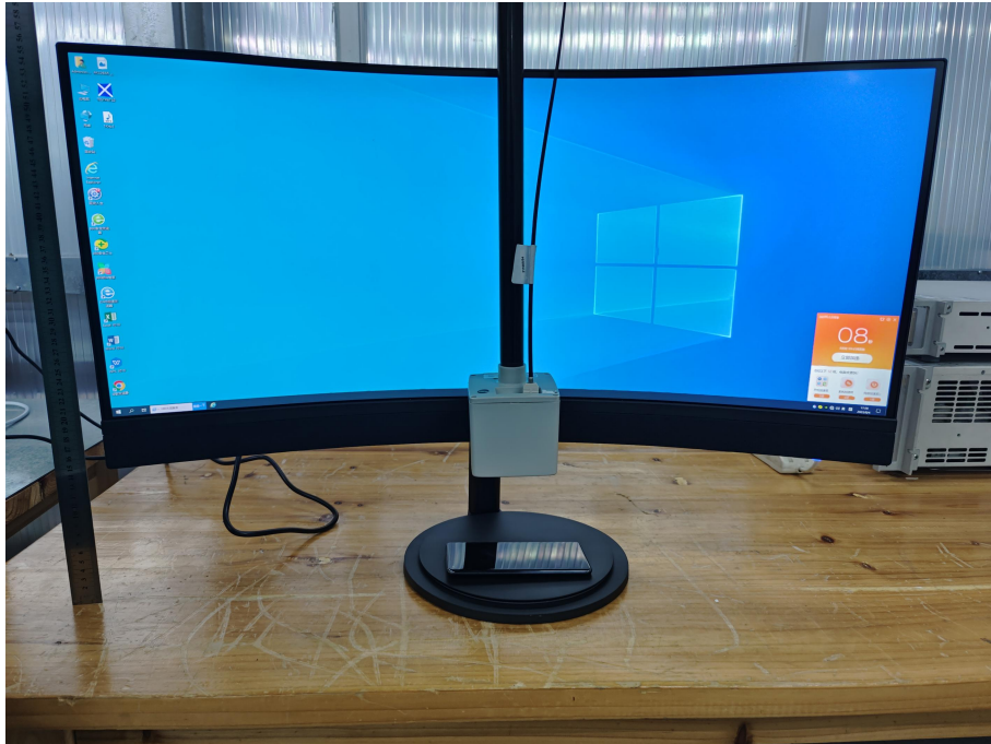
Test Position E-15cm from the edge of EUT to the geometric center of the probe