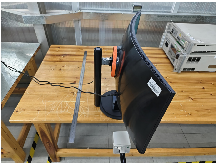
Test Position B-15cm from the edge of EUT to the geometric center of the probe