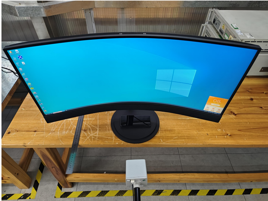
Test Position A-15cm from the edge of EUT to the geometric center of the probe