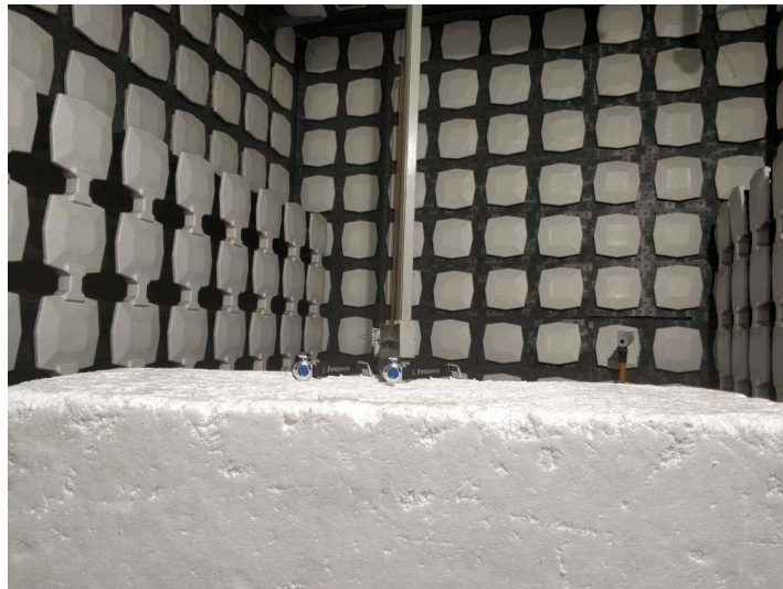
Radiated Emission (Above 1G)