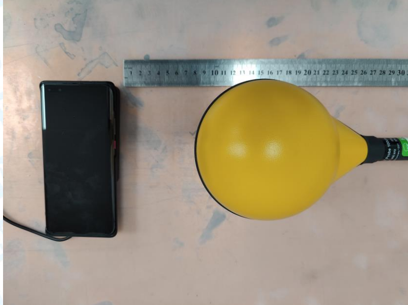
Test Position B - Exposure photo from side edge surface-Left