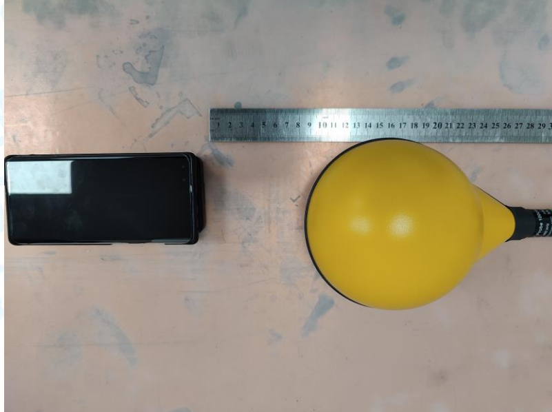
Test Position C - Exposure photo from side edge surface-Front