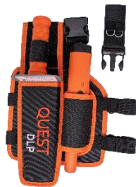
Drop Leg Pouch