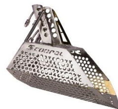
Scoopal Sand Scoop