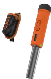
Xpointer Max w/discrimination