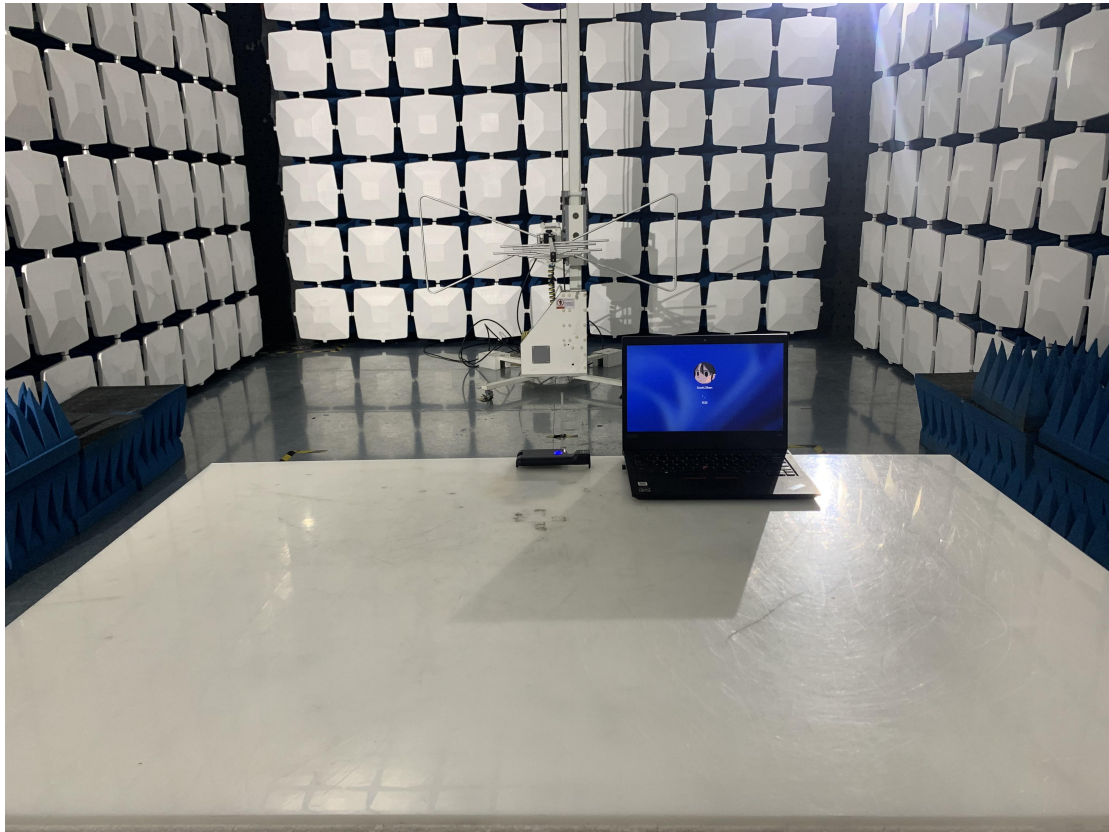
Above 1GHz for radiated emission test setup