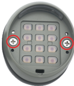
2. Remove these two screws