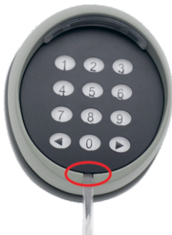
1. Use a tool to pry open the cover here

(※ Note: In order to ensure the safety of the device, the serial number of this device will be automatically updated after restoring the factory settings, and it needs to be re-registered by the receiver to work).