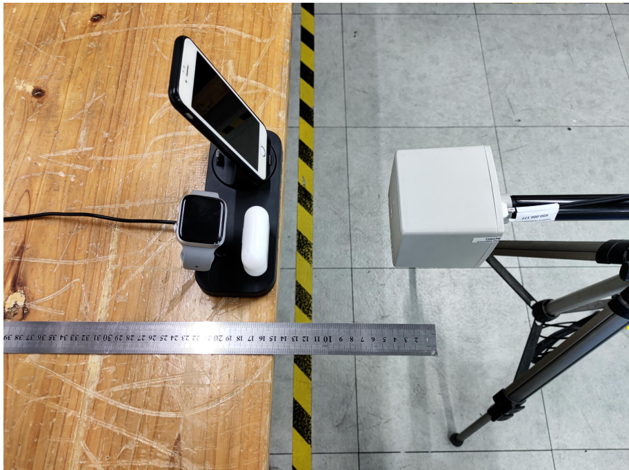
Test Position A-15cm from the edge of EUT to the geometric center of the probe