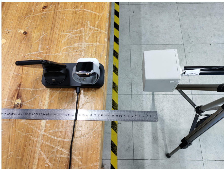
Test Position B-15cm from the edge of EUT to the geometric center of the probe