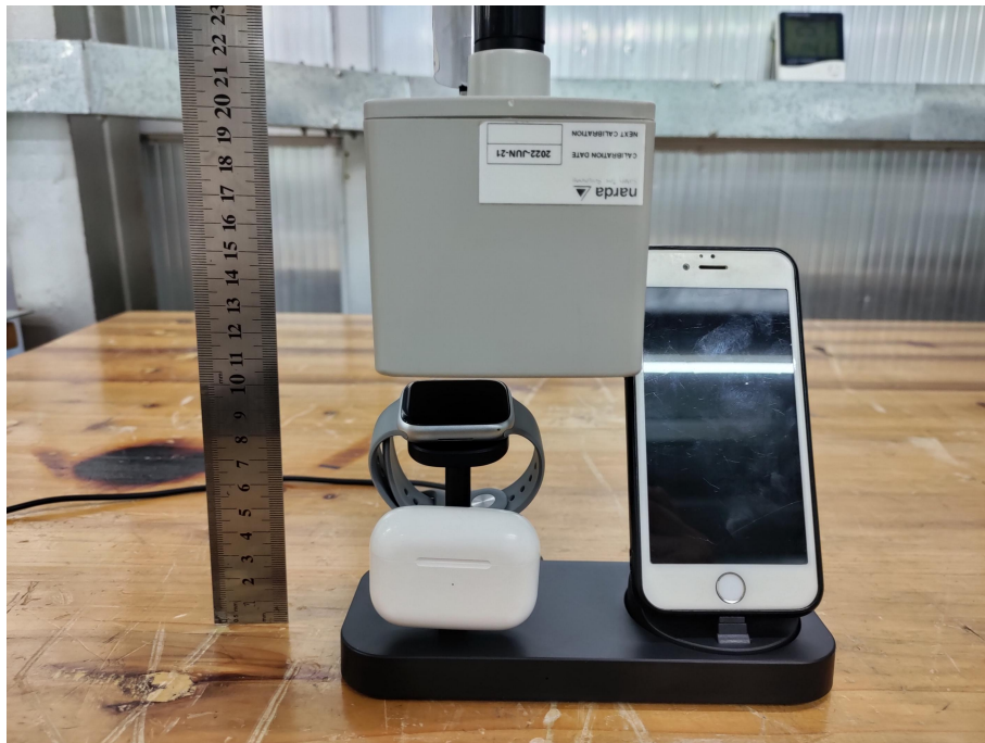
Test Position E-15cm from the edge of EUT to the geometric center of the probe