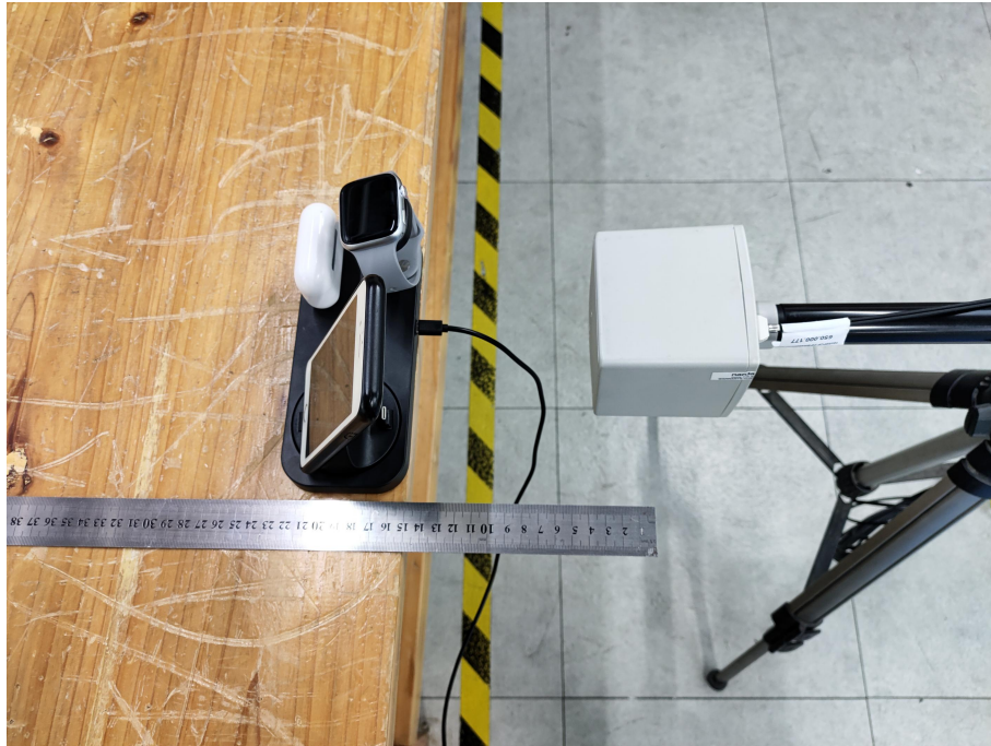
Test Position C-15cm from the edge of EUT to the geometric center of the probe