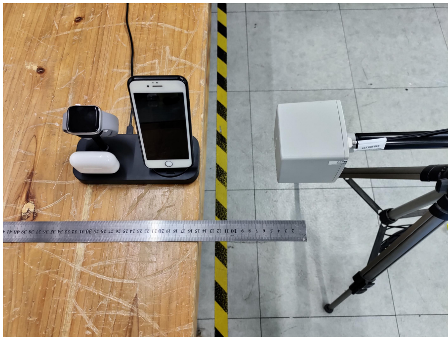
Test Position D-15cm from the edge of EUT to the geometric center of the probe