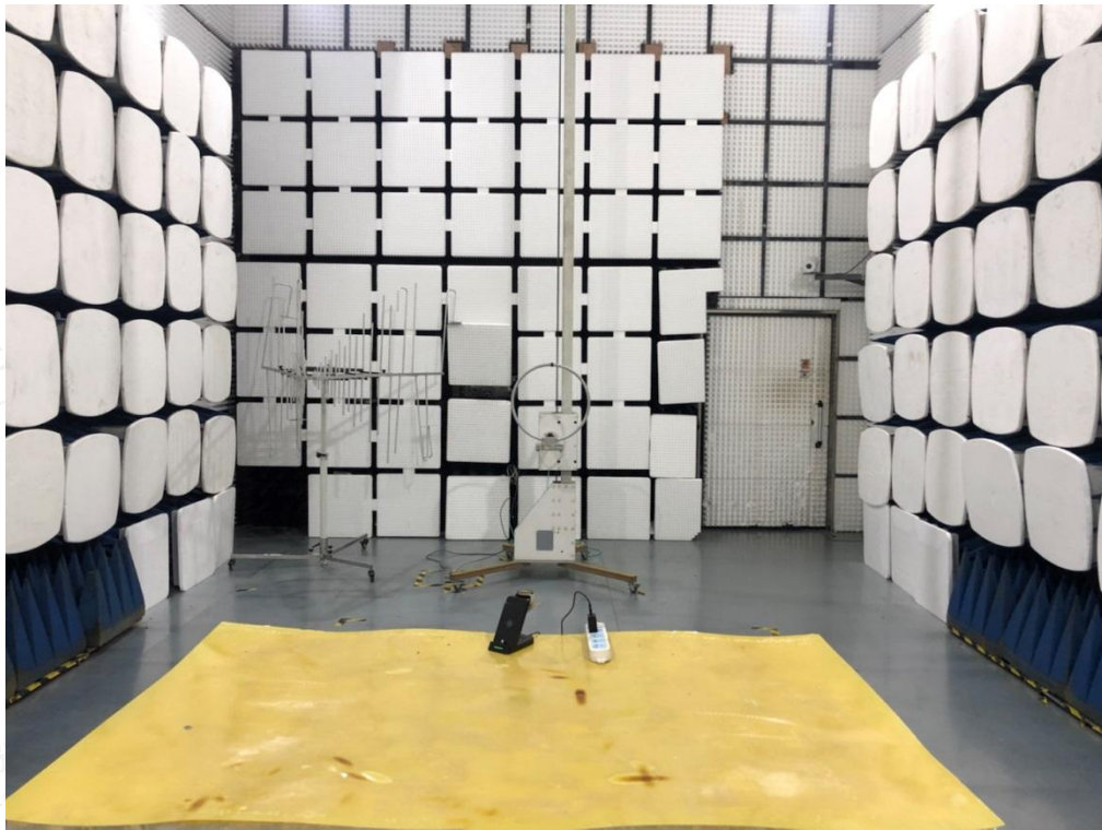
Radiated Emission below 30MHz-AC adapter charge mode