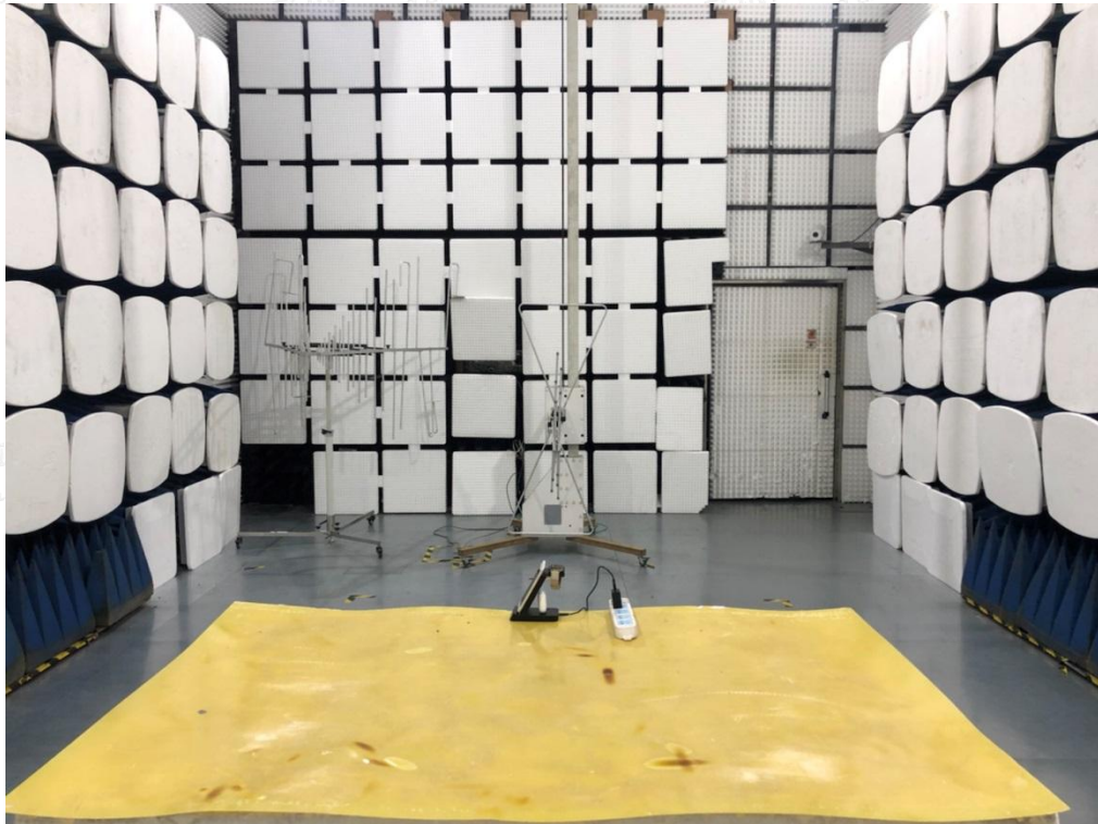
Radiated Emission below 1GHz-AC adapter charge mode