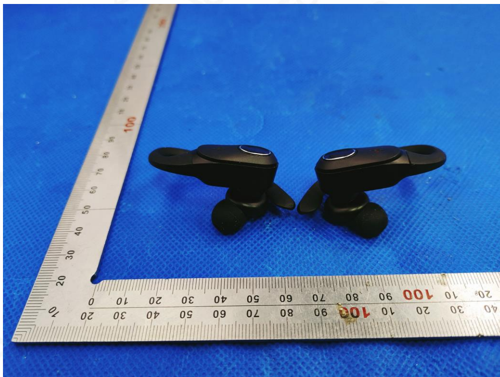
PORT VIEW OF EUT