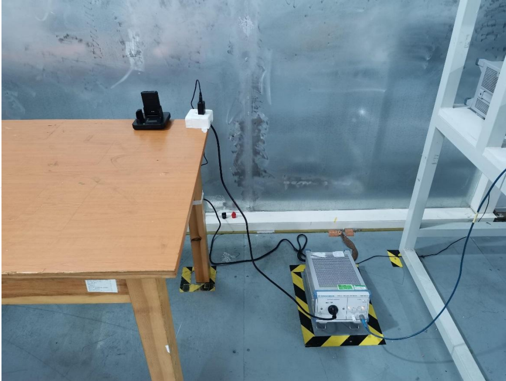
Conducted Emission-AC adapter charge mode